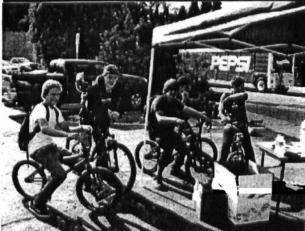
Following through on a challenge given by faculty at El Dorado High, on May 19th, 2006 these students rode their bikes from Pollock Pines to Placerville.

Three types of bicycle facilities or "bikeways" exist in California: