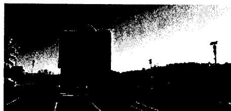
2021-03-11 ORHS Tower 747K

Straight Shot Consulting 530-306-6390 // krg@d-web.com