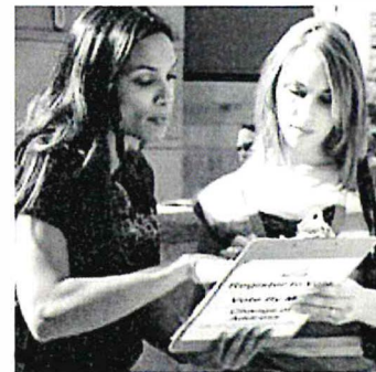
Rosario Dawson, actor and activist, registering voters on National Voter Registration Day 2012.

National Voter Registration Day is a national holiday celebrating our democracy. It was first observed in 2012 and has been growing in popularity every year since. Held on the fourth Tuesday of September, National Voter Registration Day will be observed on Tuesday, September 25th this year. The holiday has been endorsed by the National Association of Secretaries of State ( NASS ). It is further supported by the National Association of State Election Directors ( NASED ).