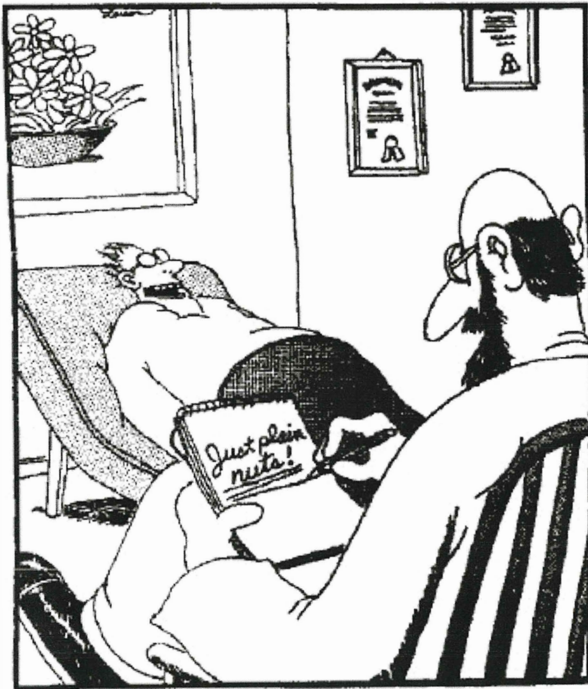
From Far Side