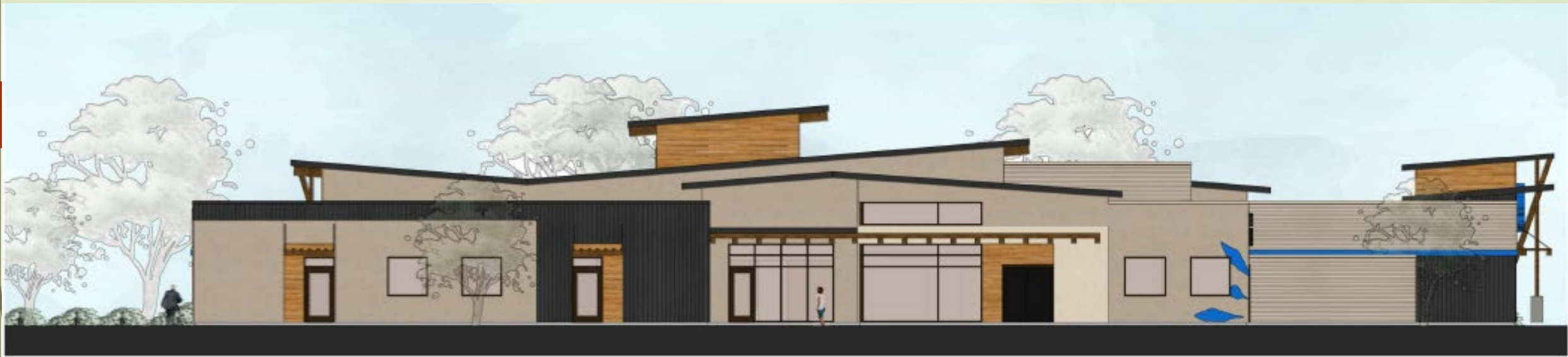
employee / southeast elevation