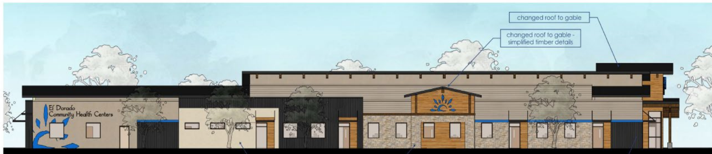
revised missouri flat / northeast elevation