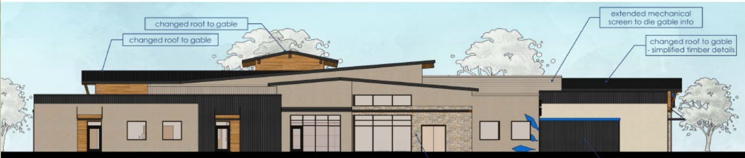
revised employee / southeast elevation