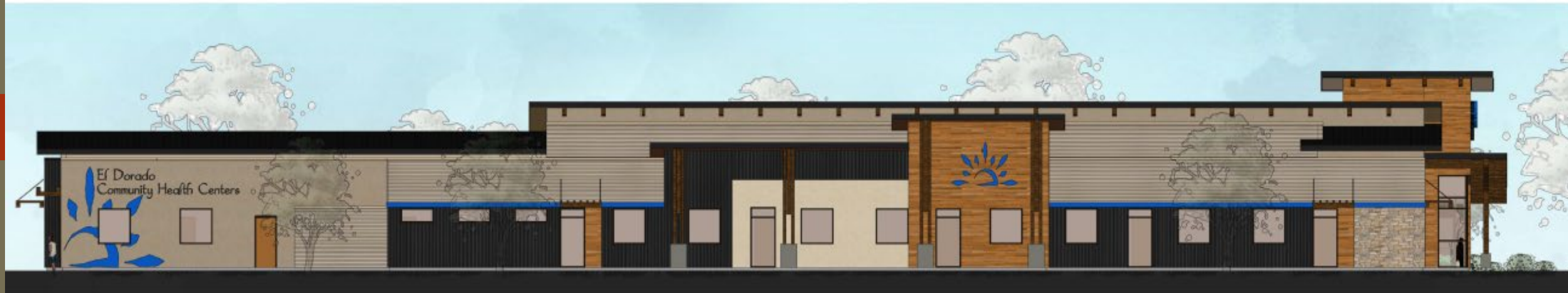
missouri flat / northeast elevation