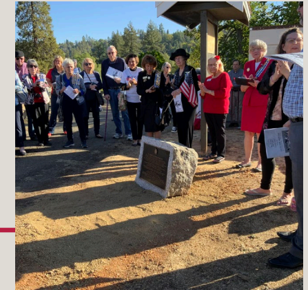
REPRESENT THE MUSEUM IN OTHER FORUMS