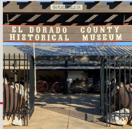
RECOMMEND MUSEUM POLICIES