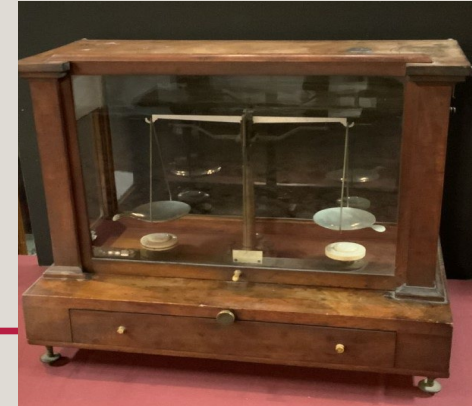
MAKE RECOMMENDATIONS TO ACCEPT OR REJECT ARTIFACT DONATIONS