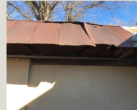
BUDGET AND FUNDING RECOMMENDATIONS