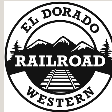
STRATEGIC PLANNING RECOMMENDATIONS