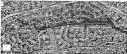
Nature path, streams, trails.png 2212K