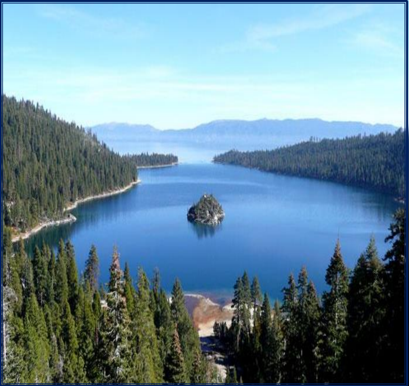
Emerald Bay, Lake Tahoe