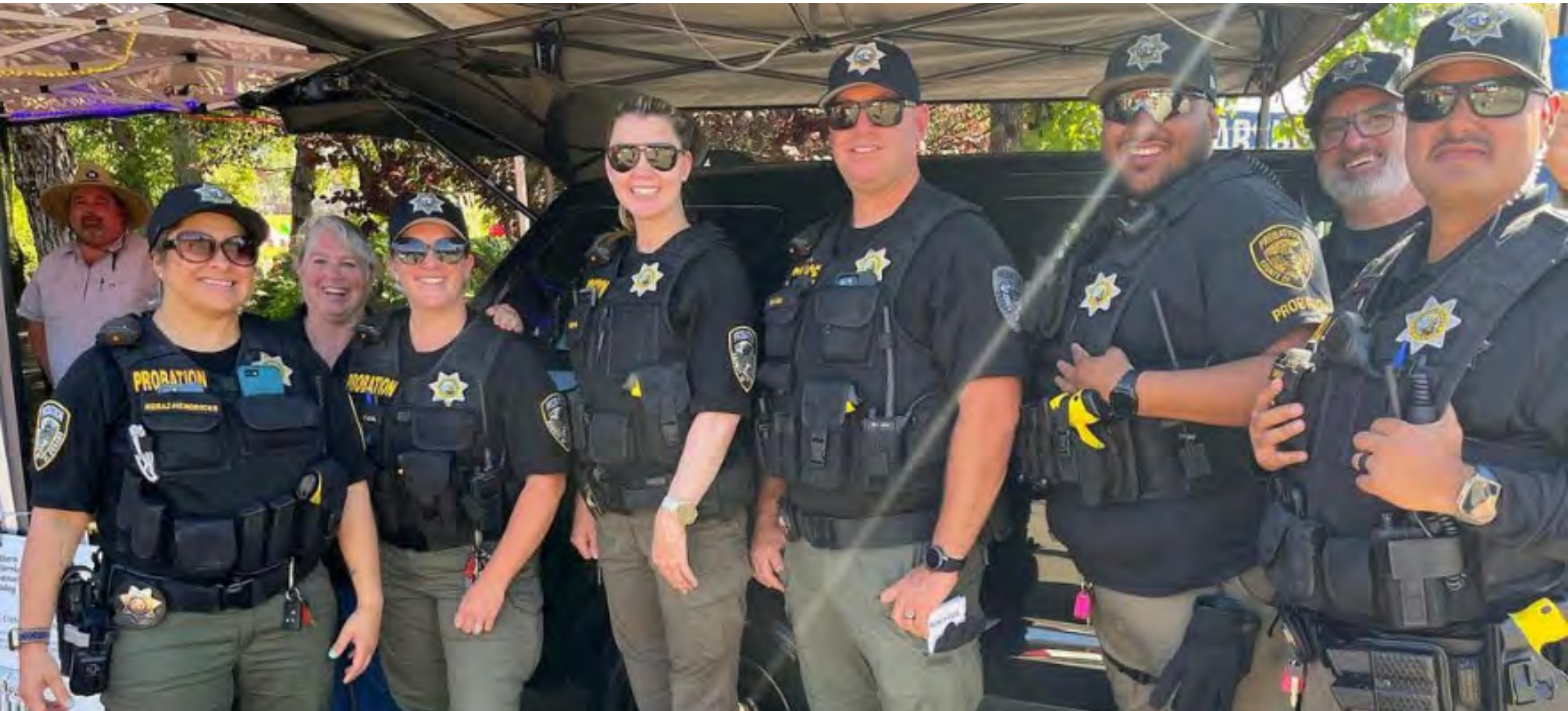
July 21-27, 2024, is Probation Services Week, which recognizes the incredible work done by community corrections professionals to restore trust and create hope and keep our communities safe.