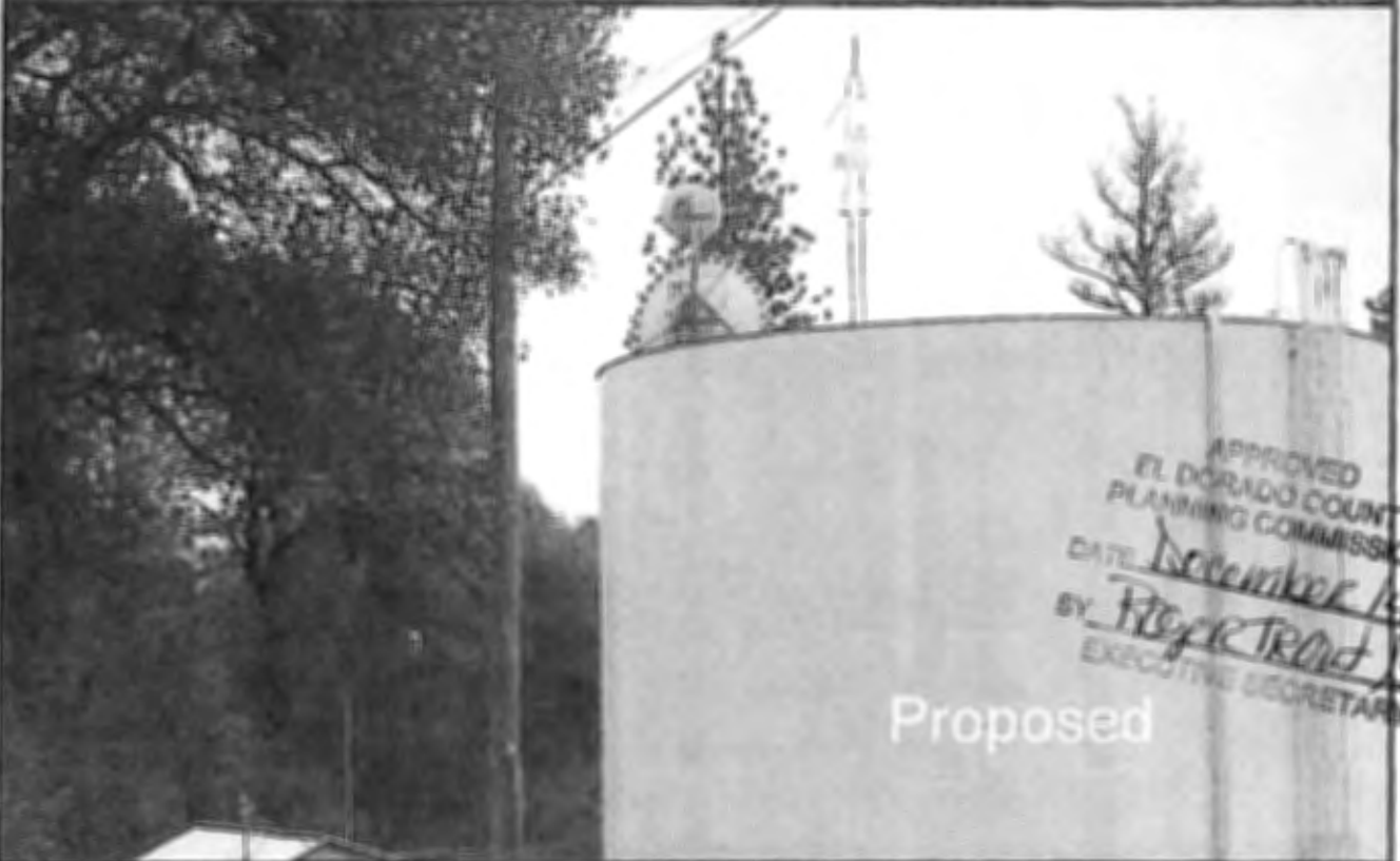
Photo simulation of view looking east

Cal.net CASF Wireless Broadband Project Auburn Trails Project Site - Simulated View 2151 Angel Camp Court, Coon, 95414