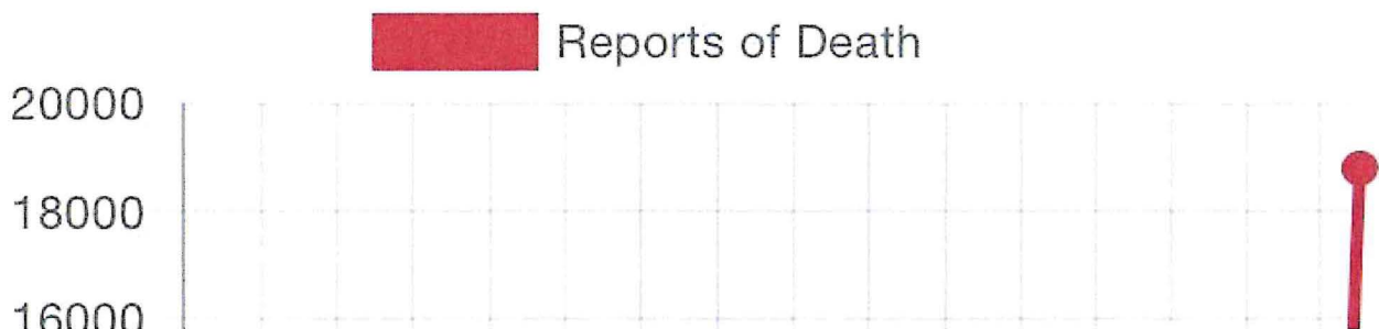
All Deaths Reported to VAERS by Year