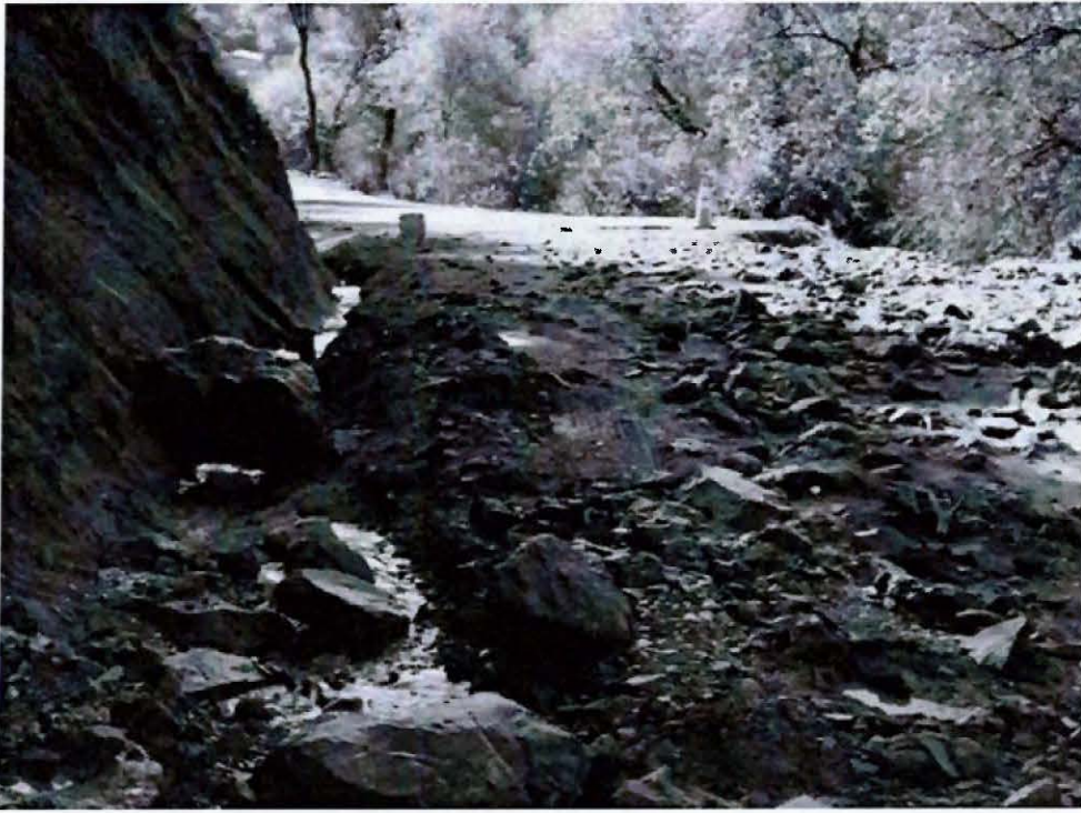
Runoff still flowing strong: