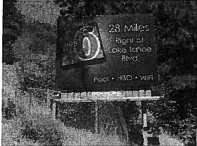
Pictures US 50 sign 08-03-12 011.jpg 155K