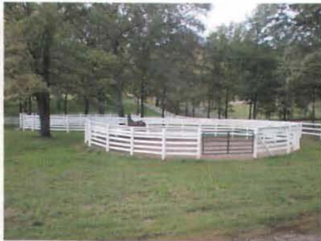
Round Turnouts Side by Side