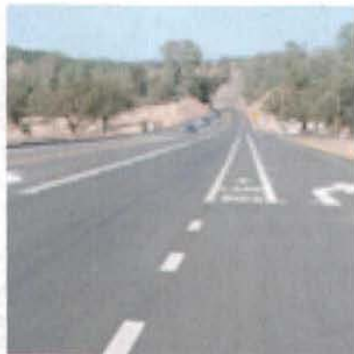
East on Green Valley