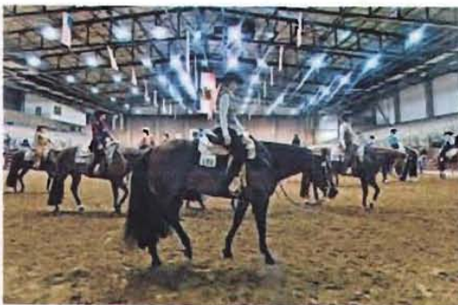
Night Time Dressage