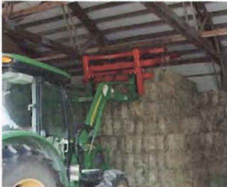
Tractor Stacking Hay