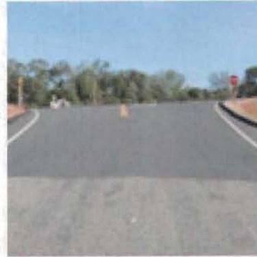
S. Deer Valley at Green Valley