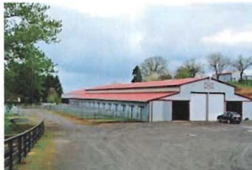
Outside View Enclosed Stables