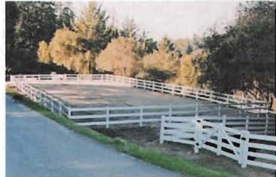
Square Turnouts Side by Side