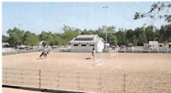
Outdoor Open Arena with Jumps