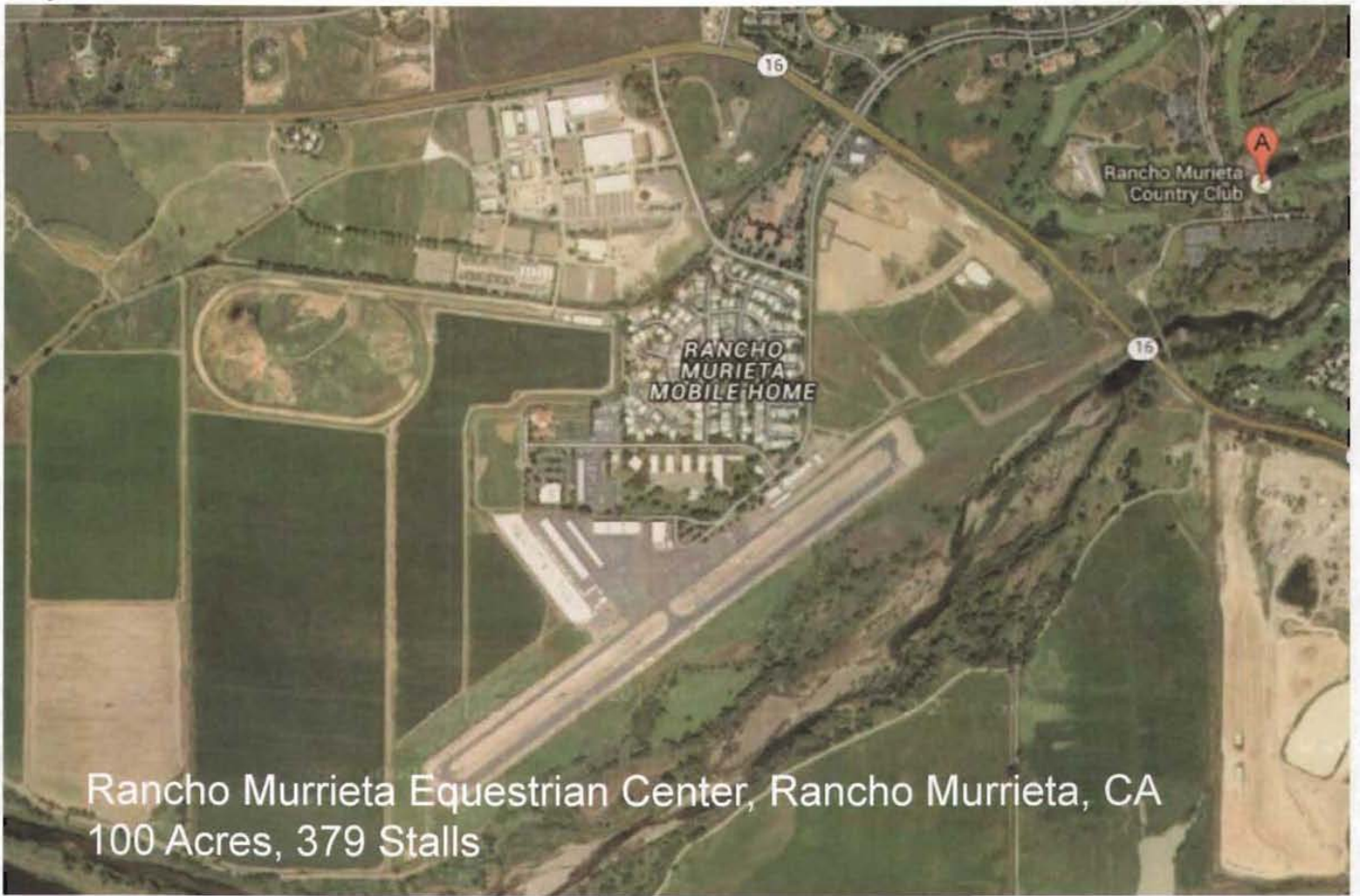
Rancho Murrieta Equestrian Center, Rancho Murrieta, CA 100 Acres, 379 Stalls