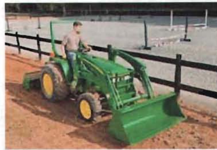
Tractor On Grounds