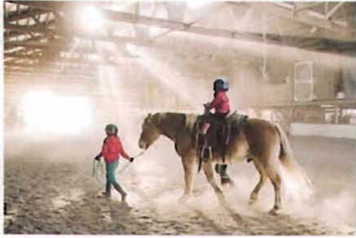
Kids' Riding Lessons