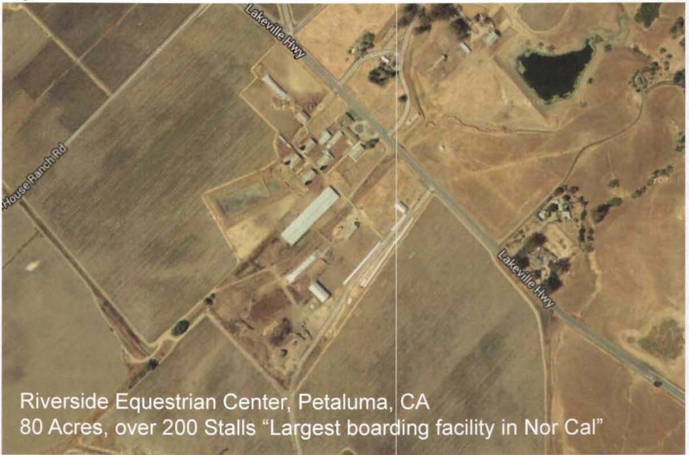
Riverside Equestrian Center, Petaluma, CA 80 Acres, over 200 Stalls “Largest boarding facility in Nor Cal”