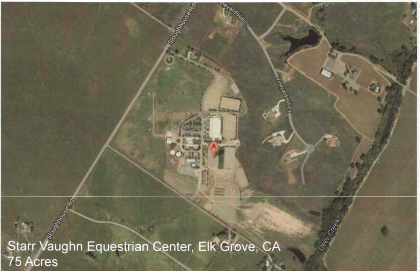
Starr Vaughn Equestrian Center, Elk Grove, CA 75 Acres