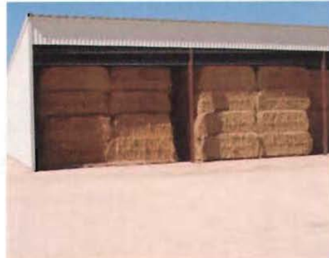
Covered Hay Supply