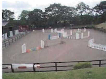
Outdoor Arena with Jumps