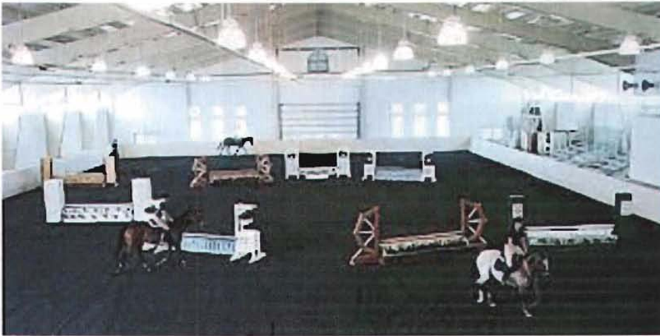
Indoor Arena with Jumps

Two of the seven riding Arenas will be enclosed to provide year round riding for the boarders within the facility. The only enclosed riding arenas nearby are located 25 miles away in Rancho Murrieta.