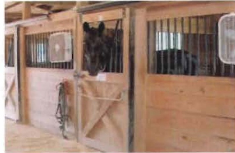
Covered Stall Inside View