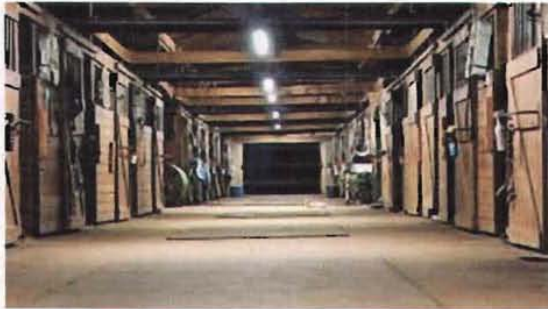
Hallway of Inside Barn