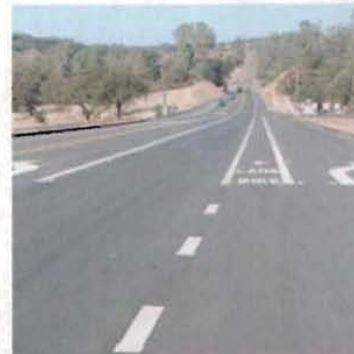
West on Green Valley