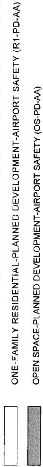
REVISED EXHIBIT A: CAMERON HILLS REZONE MAP