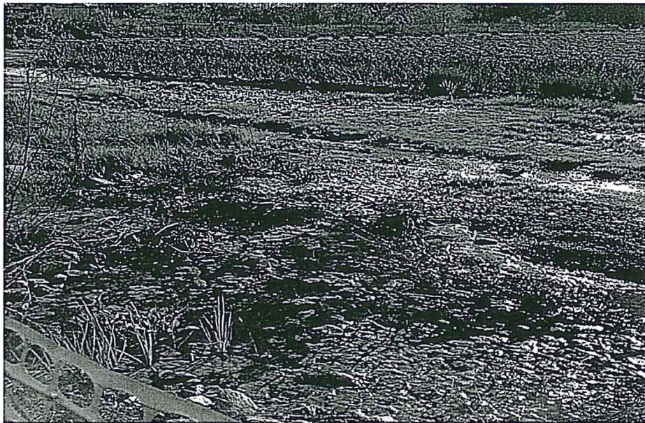
Looking south to Shadowfax Lane from our property. April 27, 2014