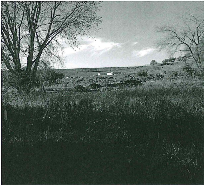
From our property. Green Valley Nursery Large Dirt Piles -Grading