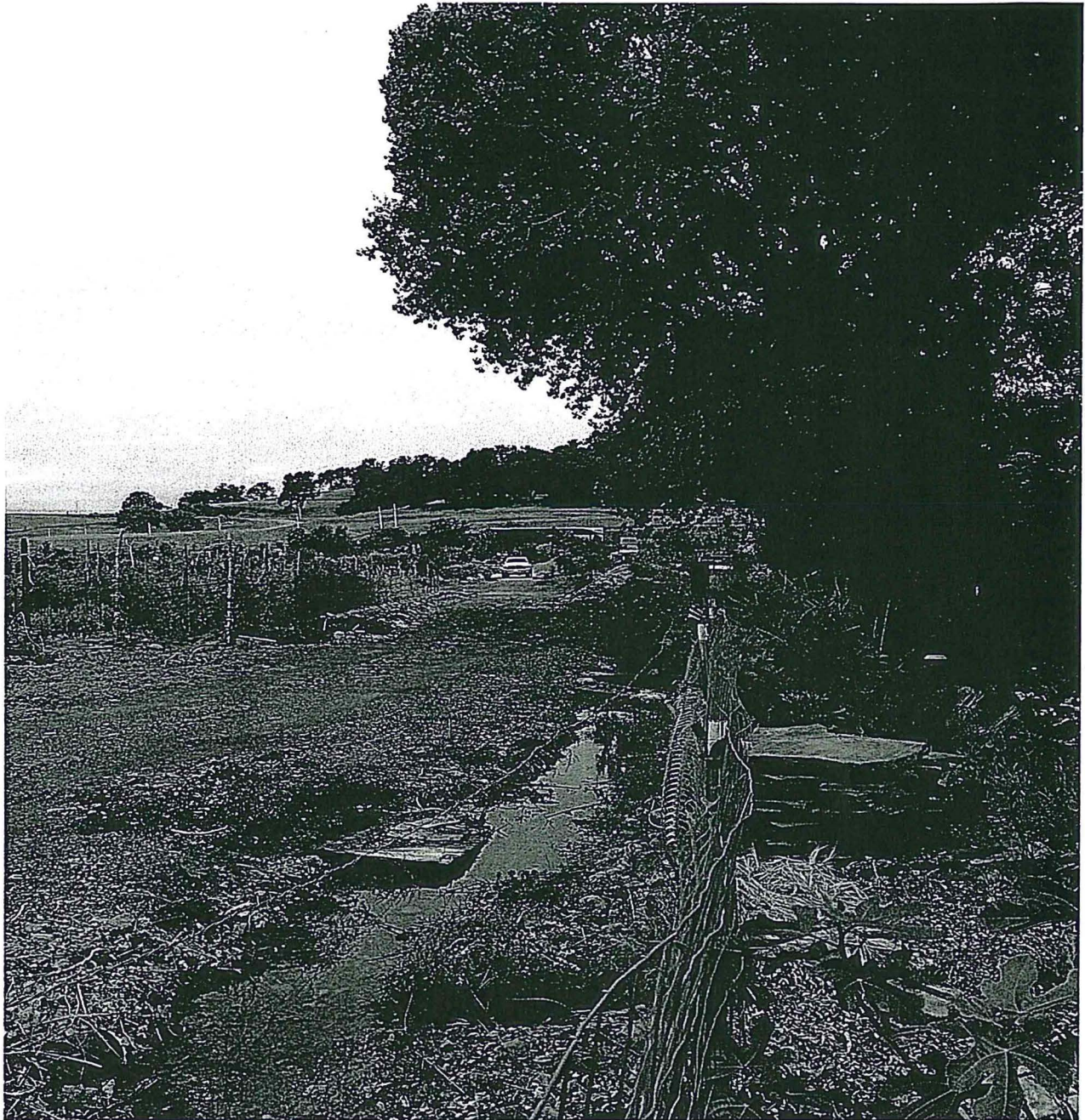
More stagnant water. Looking north to GVN and Green Valley Road. Dirt piles, trash.