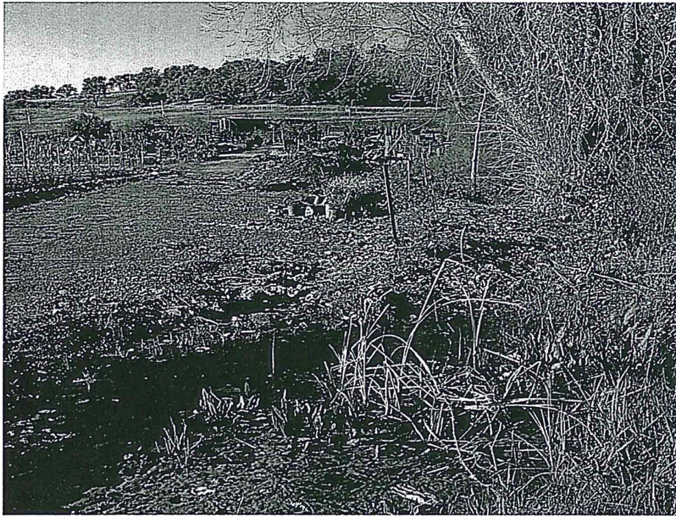
Trash Pile, Stagnant Water, Dirt Piles