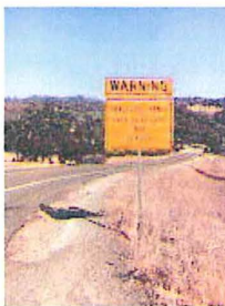
truck sign.JPG 1521K