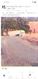
truck stuck 1.jpeg 79K