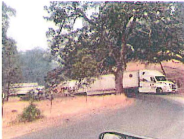
truck 2.jpg 3364K