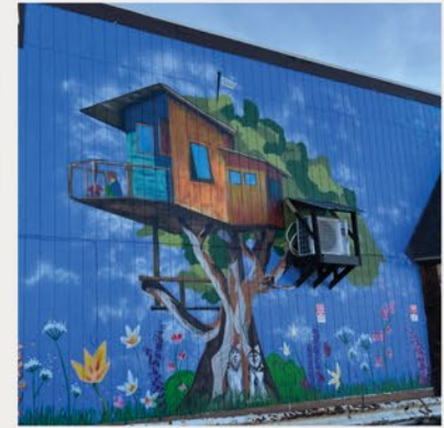
Hwy 50 / Bijou, South Lake Tahoe (Arts Culture Tourism Commission)

Public art installations across the state funded by CalTrans, California Arts Council, and our local Arts, Culture & Tourism Commission in South Lake Tahoe have enabled millions of residents to enjoy public art