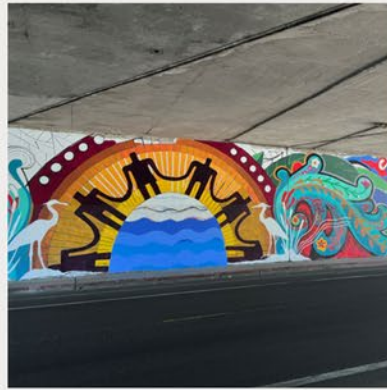
2nd Avenue, South Sacramento (CalTrans)