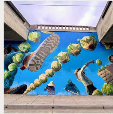
Under passageway, Salinas