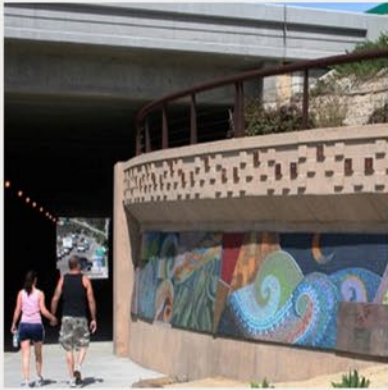
Walking path, Encinitas (CalTrans)