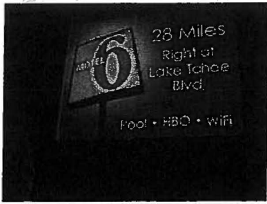
Pictures US 50 sign moonrise 08-12 016.JPE 15K