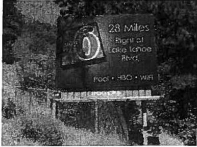
Pictures US 50 sign 08-03-12 011.jpg 155K