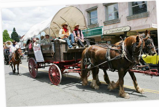
"The Gateway to the Mother Lode"