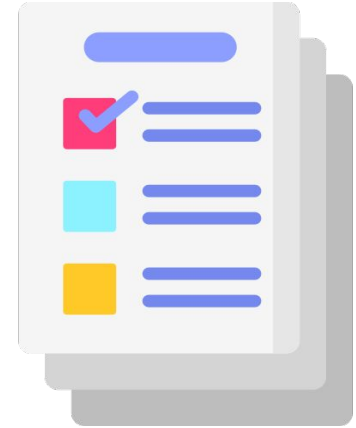
Wellness Resource Survey