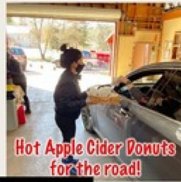
Hot Apple Cider Donuts for the road!