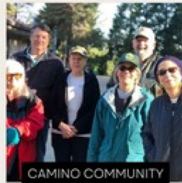
CAMINO COMMUNITY ACTION COMMITTEE