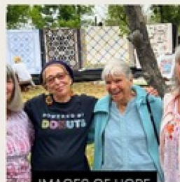
IMAGES OF HOPE