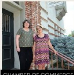
CHAMBER OF COMMERCE