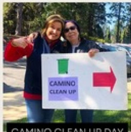
CAMINO CLEAN UP DAY