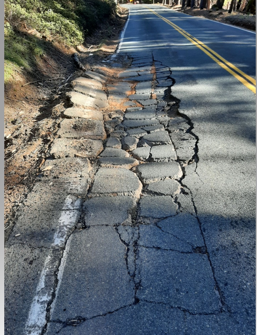
String Canyon Road