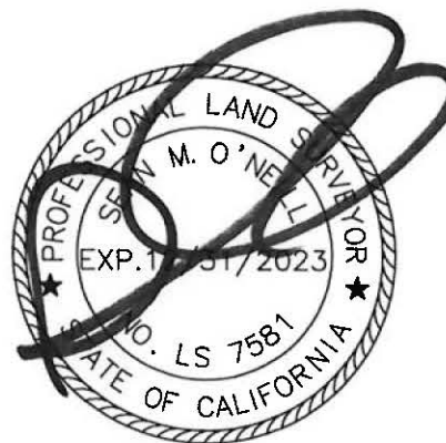
EXHIBIT B GENESIS CIVIL ENGINEERS 960 McCOURTNEY RD, STE. C GRASS VALLEY, CALIFORNIA 95949 (530) 742-1300