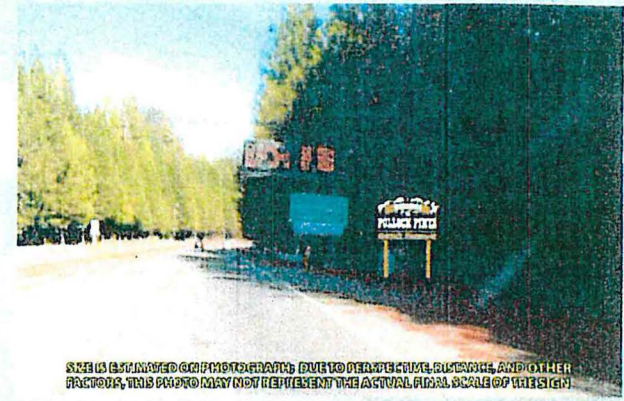
SIZE IS ESTIMATED ON PHOTOGRAPH. DUE TO PERSPECTIVE, DISTANCE, AND OTHER FACTORS, THIS PHOTO MAY NOT REPRESENT THE ACTUAL FINAL SCALE OF THE SIGN.