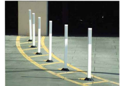
FLEXIBLE DELINEATOR EXAMPLE