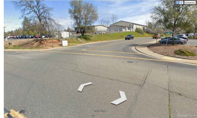
EXISTING STRIPING AND FORN AND GOLDEN CENTER