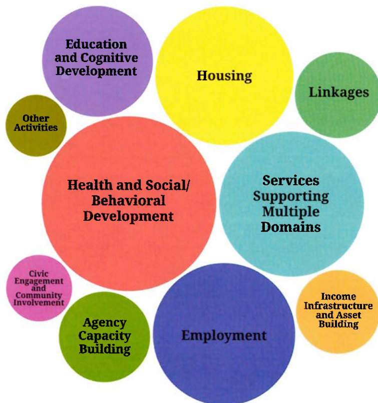
Figure I. How CSBG is used in California

In 2024, the California Community Action Network partnered with 9,000+ organizations across sectors to provide nearly 6 million total opportunities for constituents in California.