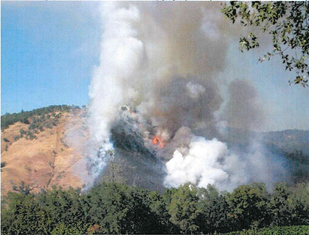
2007 Mt. Murphy Arson fire started at base of my property on Bayne Road at Troublemaker Rapids: