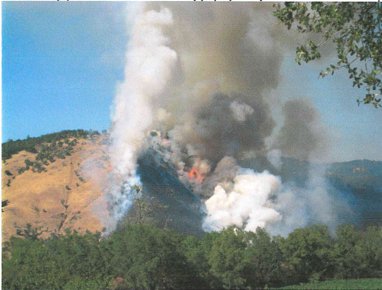
2007 Mt. Murphy Arson fire started at base of my property on Bayne Road at Troublemaker Rapids: