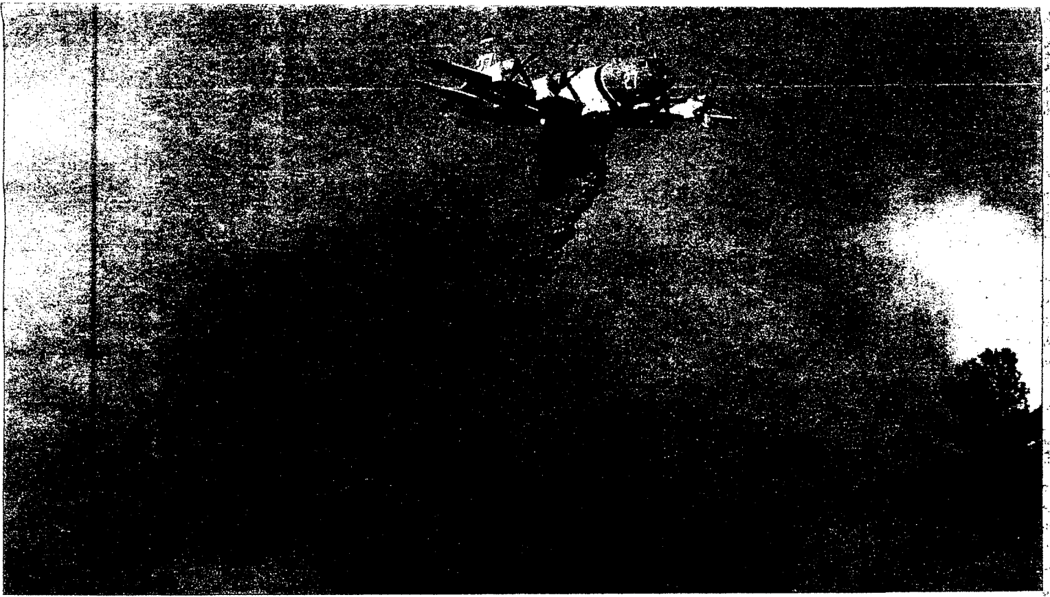
A BOMBER drops fire retardant on Mt. Murphy Sunday.