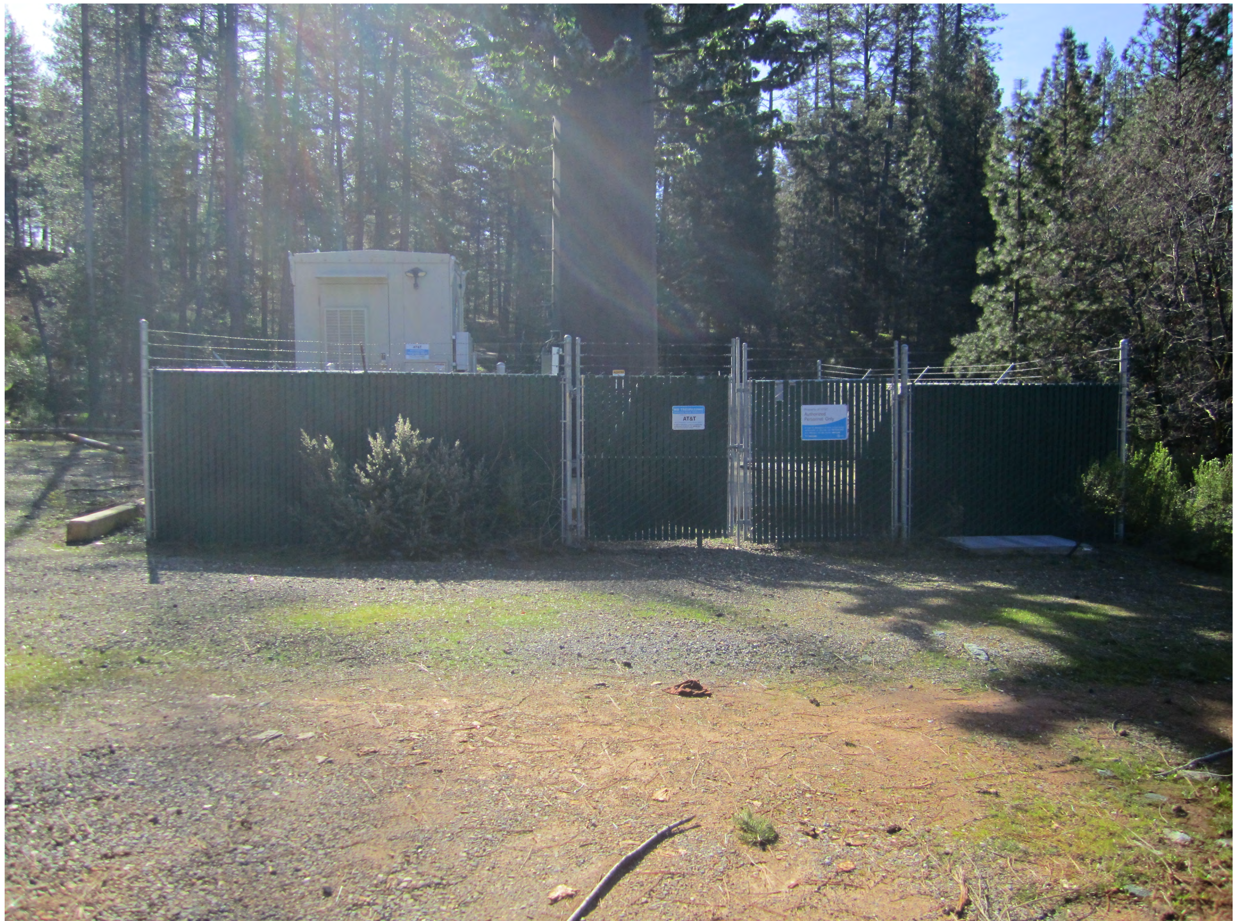
CUP-R24-0003/Five-Year Review of S17-0010 Exhibit E - Staff Current Site Photographs