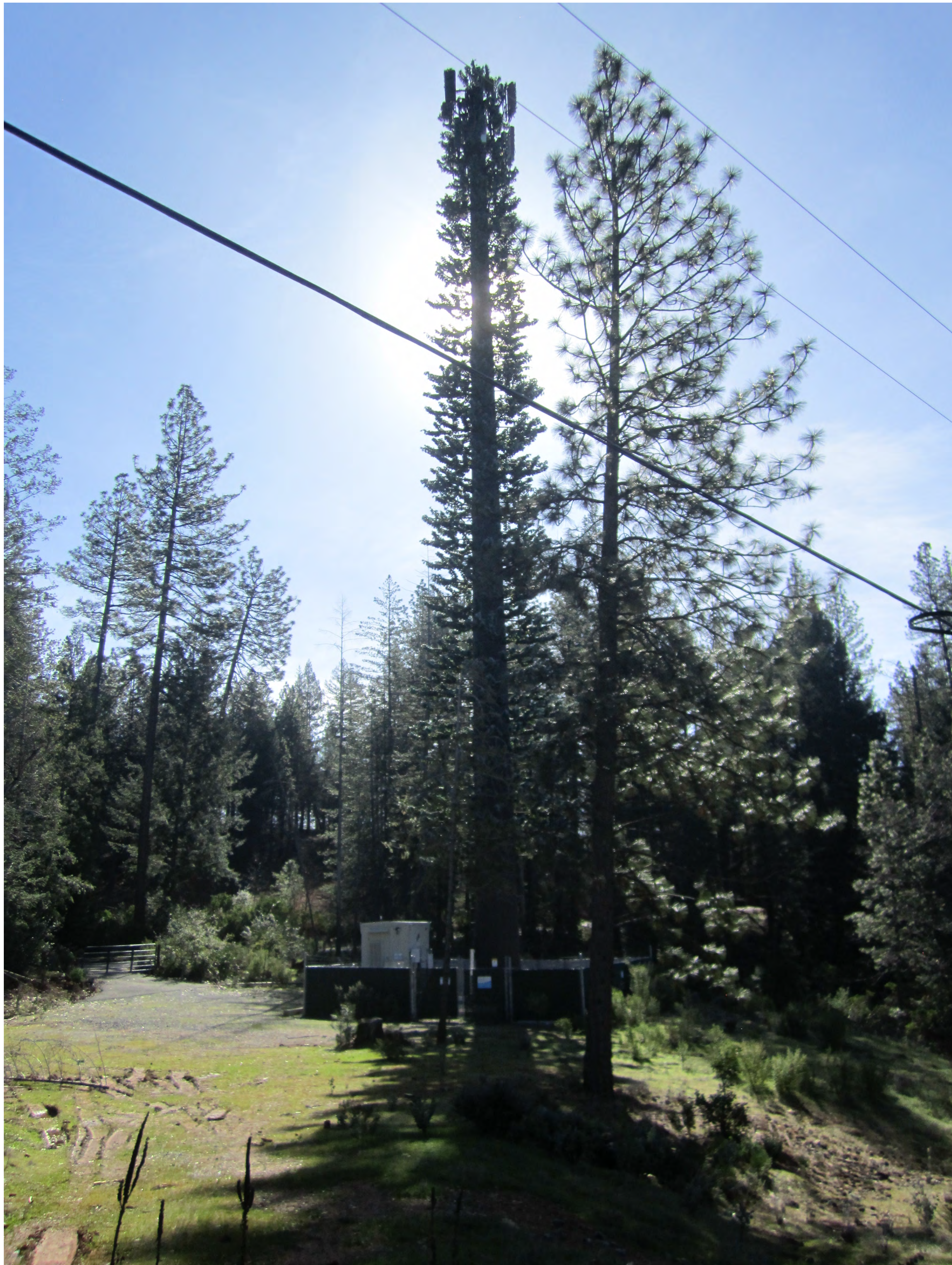
CUP-R24-0003/Five-Year Review of S17-0010 Exhibit E - Staff Current Site Photographs