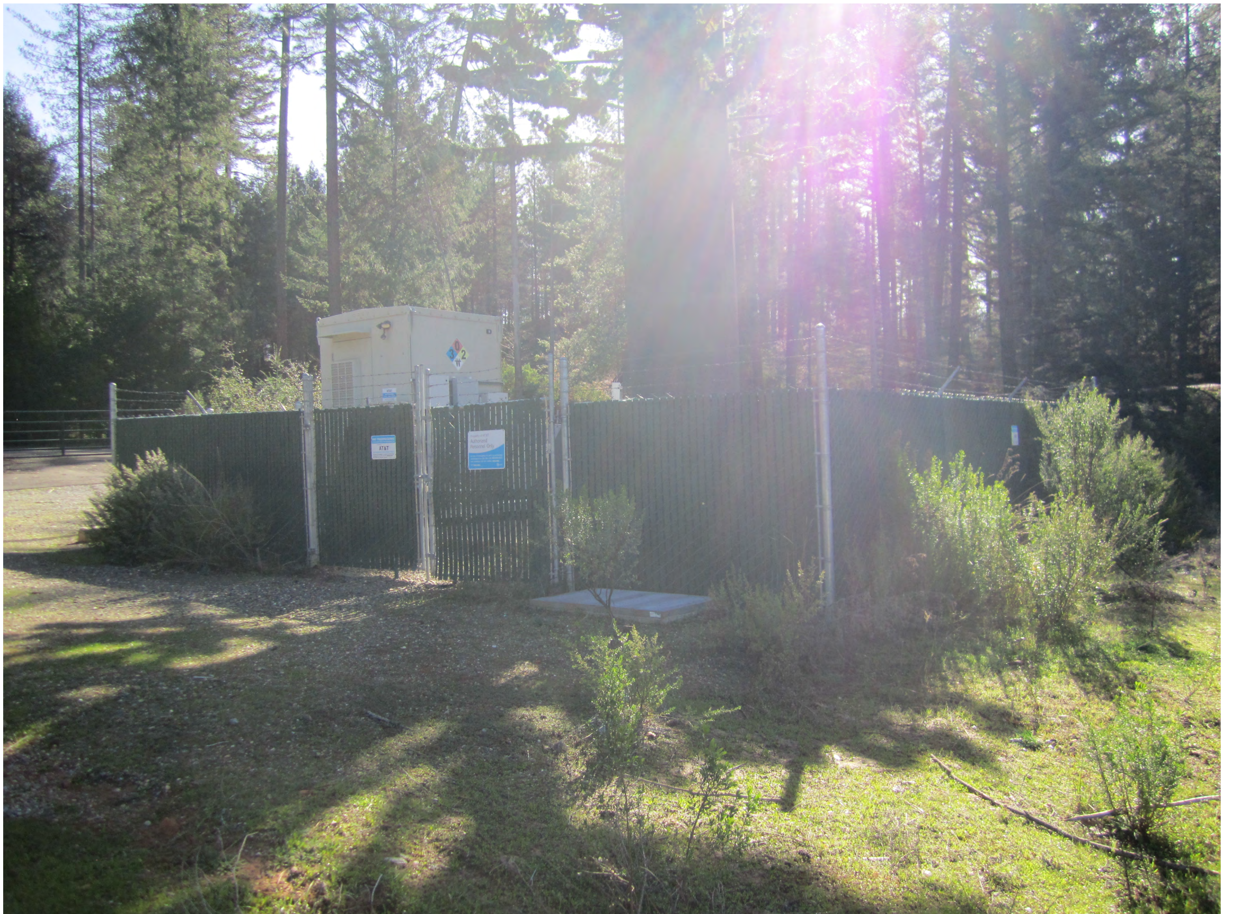
CUP-R24-0003/Five-Year Review of S17-0010 Exhibit E - Staff Current Site Photographs