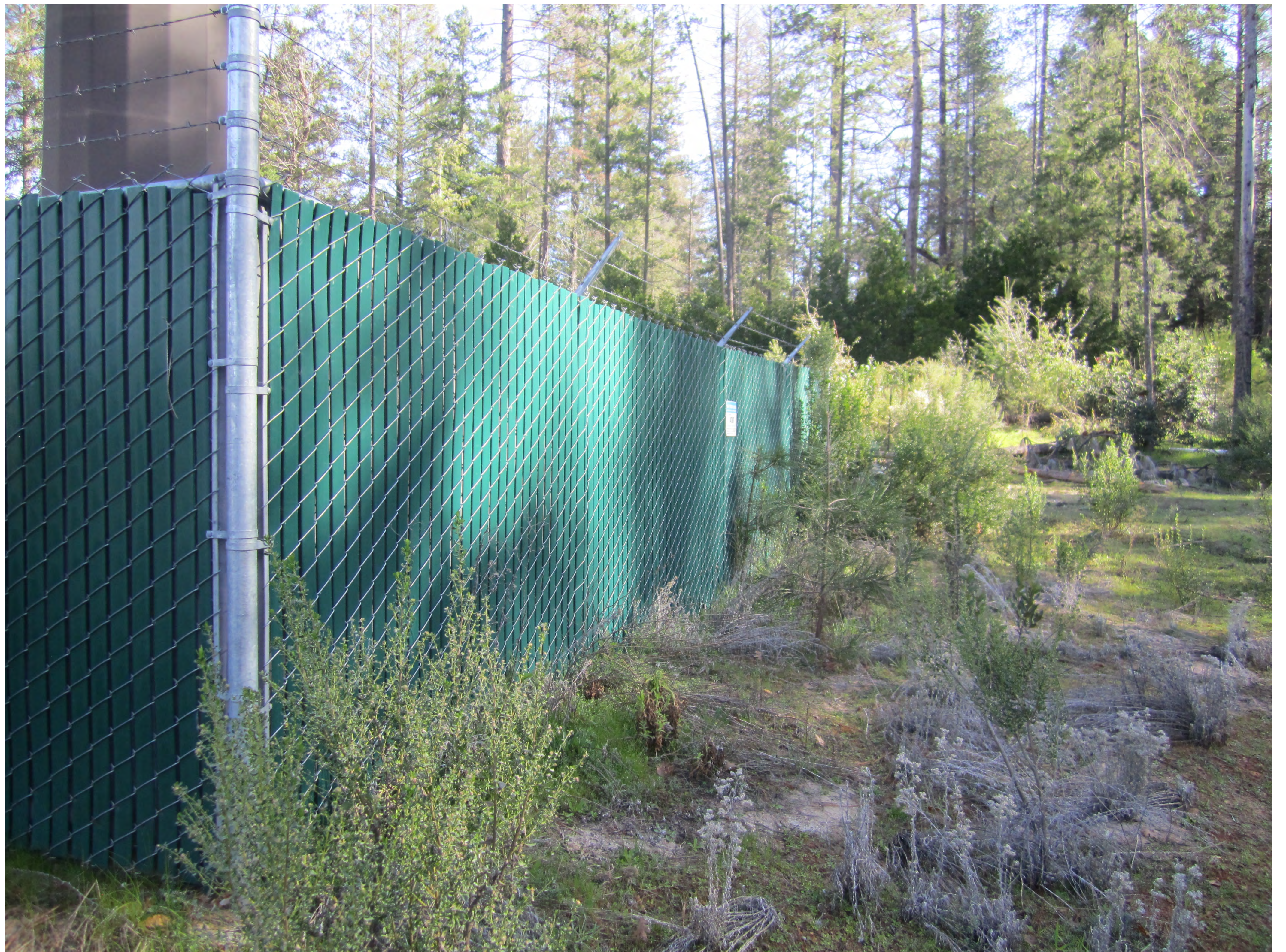
CUP-R24-0003/Five-Year Review of S17-0010 Exhibit E - Staff Current Site Photographs