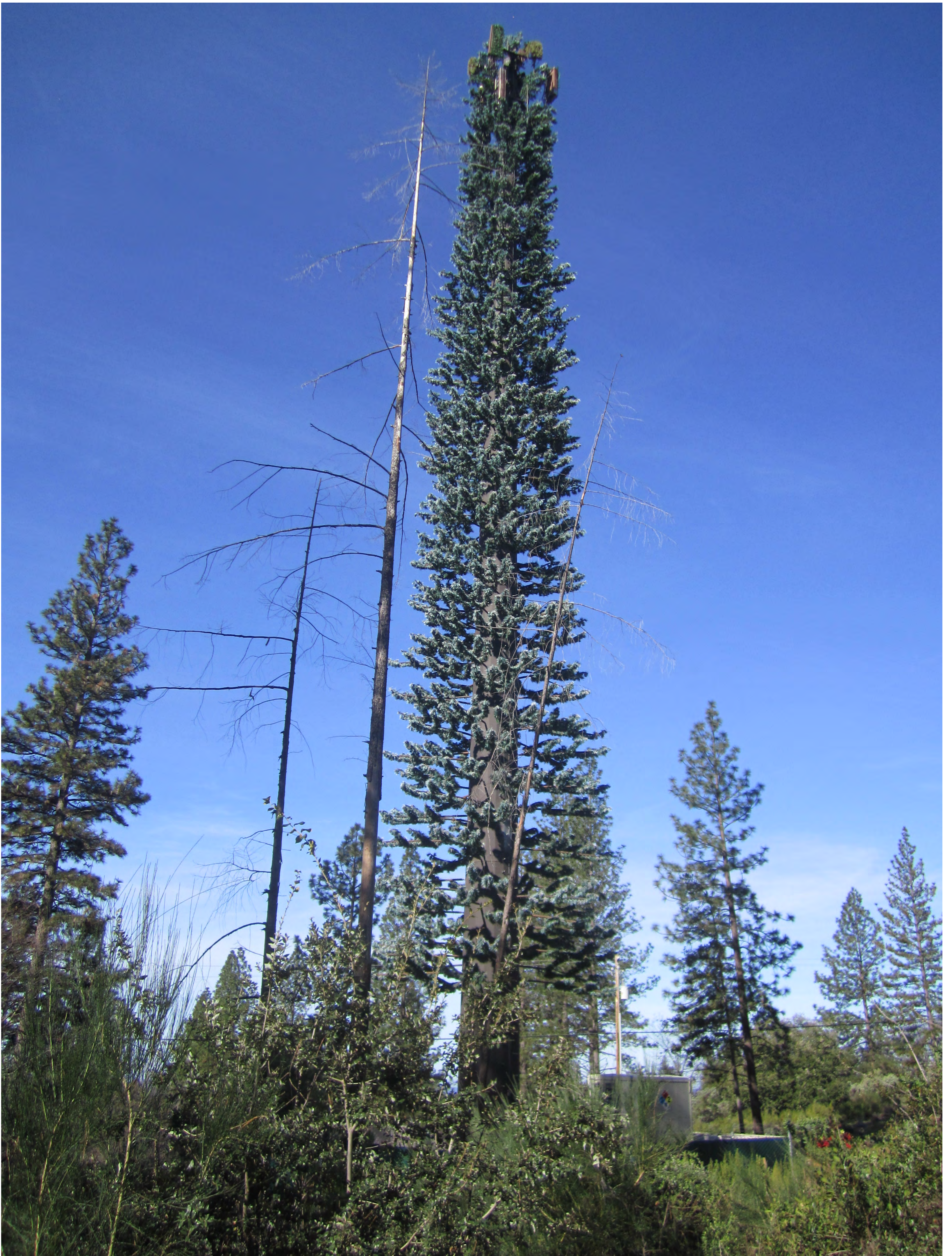
CUP-R24-0003/Five-Year Review of S17-0010 Exhibit E - Staff Current Site Photographs