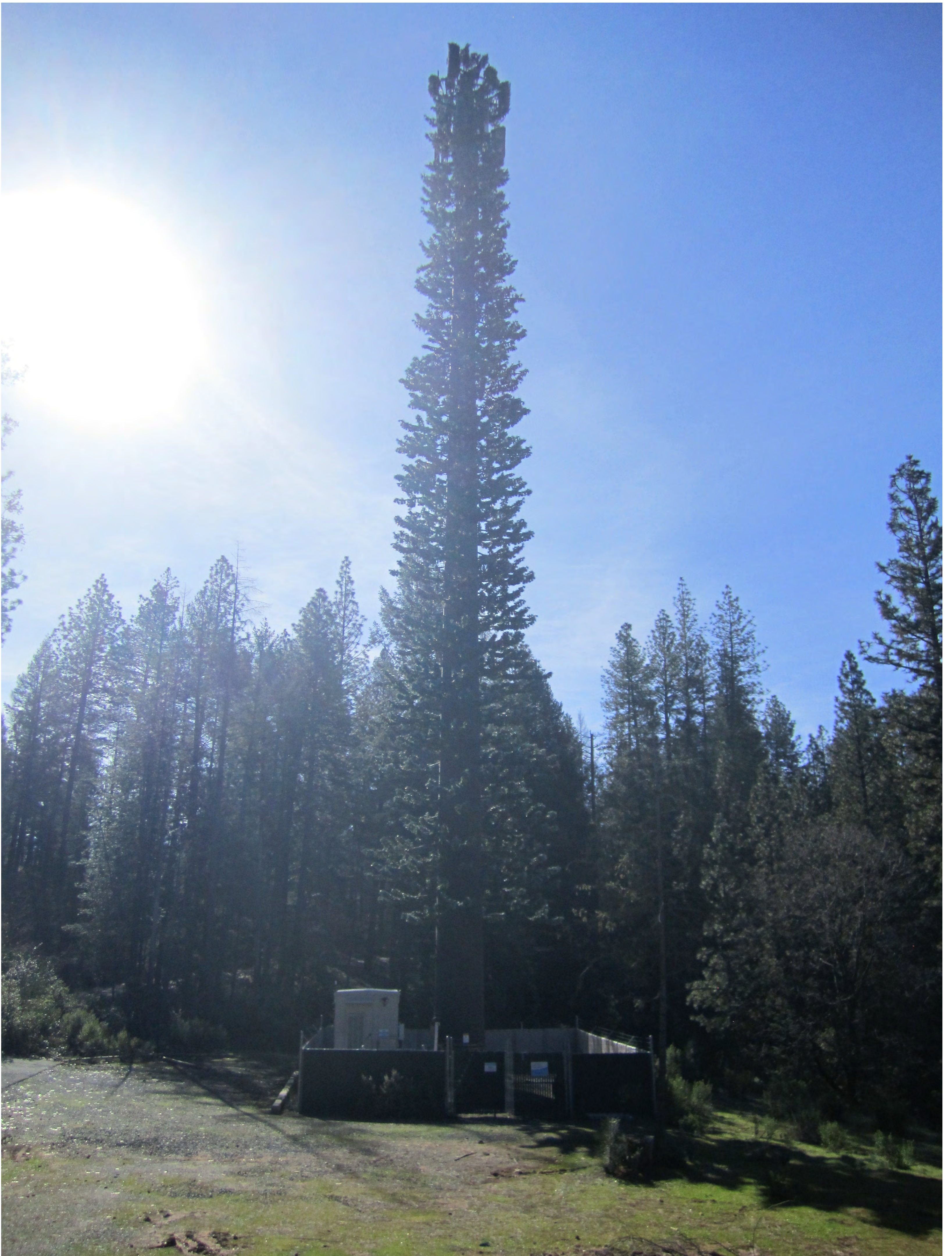
CUP-R24-0003/Five-Year Review of S17-0010 Exhibit E - Staff Current Site Photographs