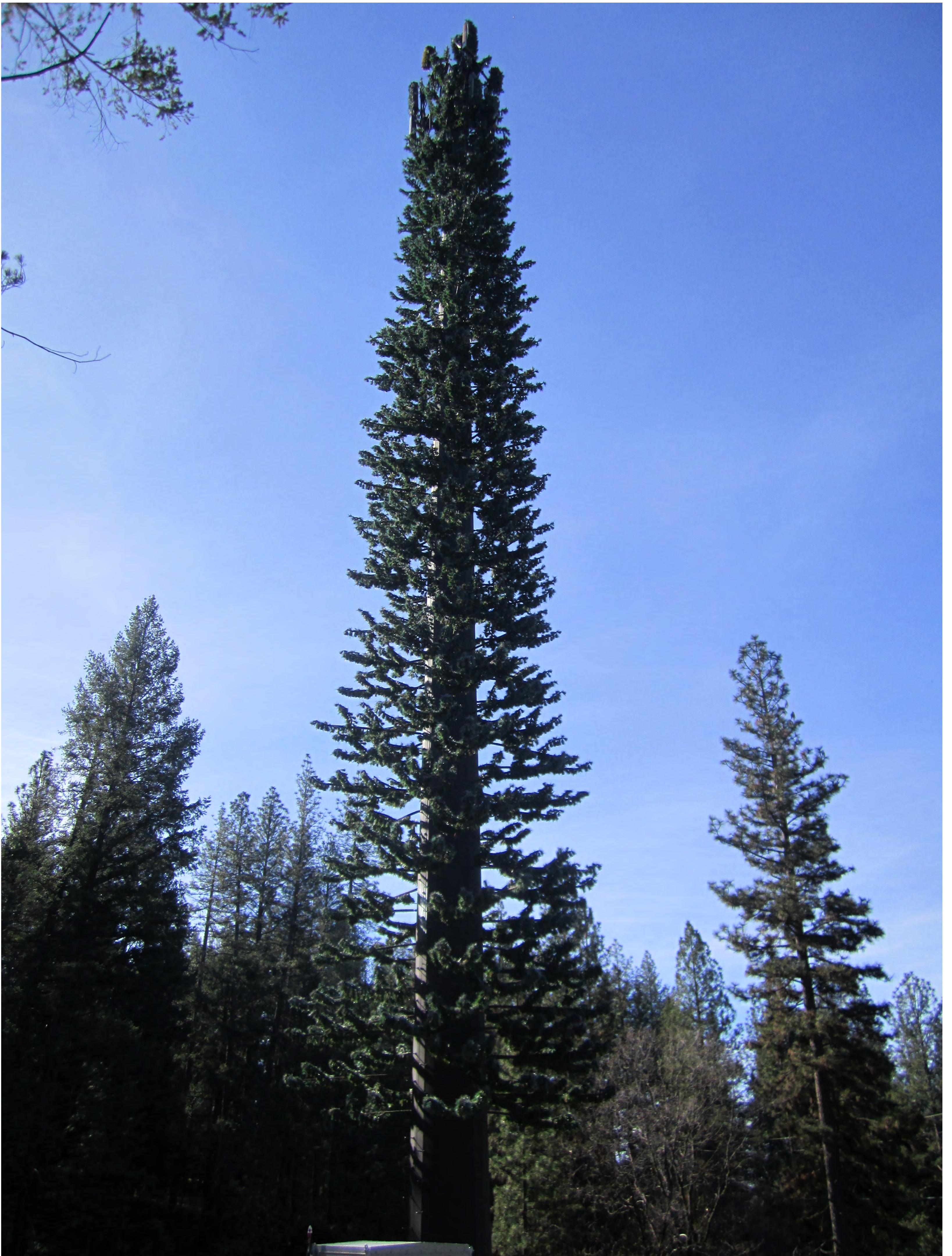
CUP-R24-0003/Five-Year Review of S17-0010 Exhibit E - Staff Current Site Photographs