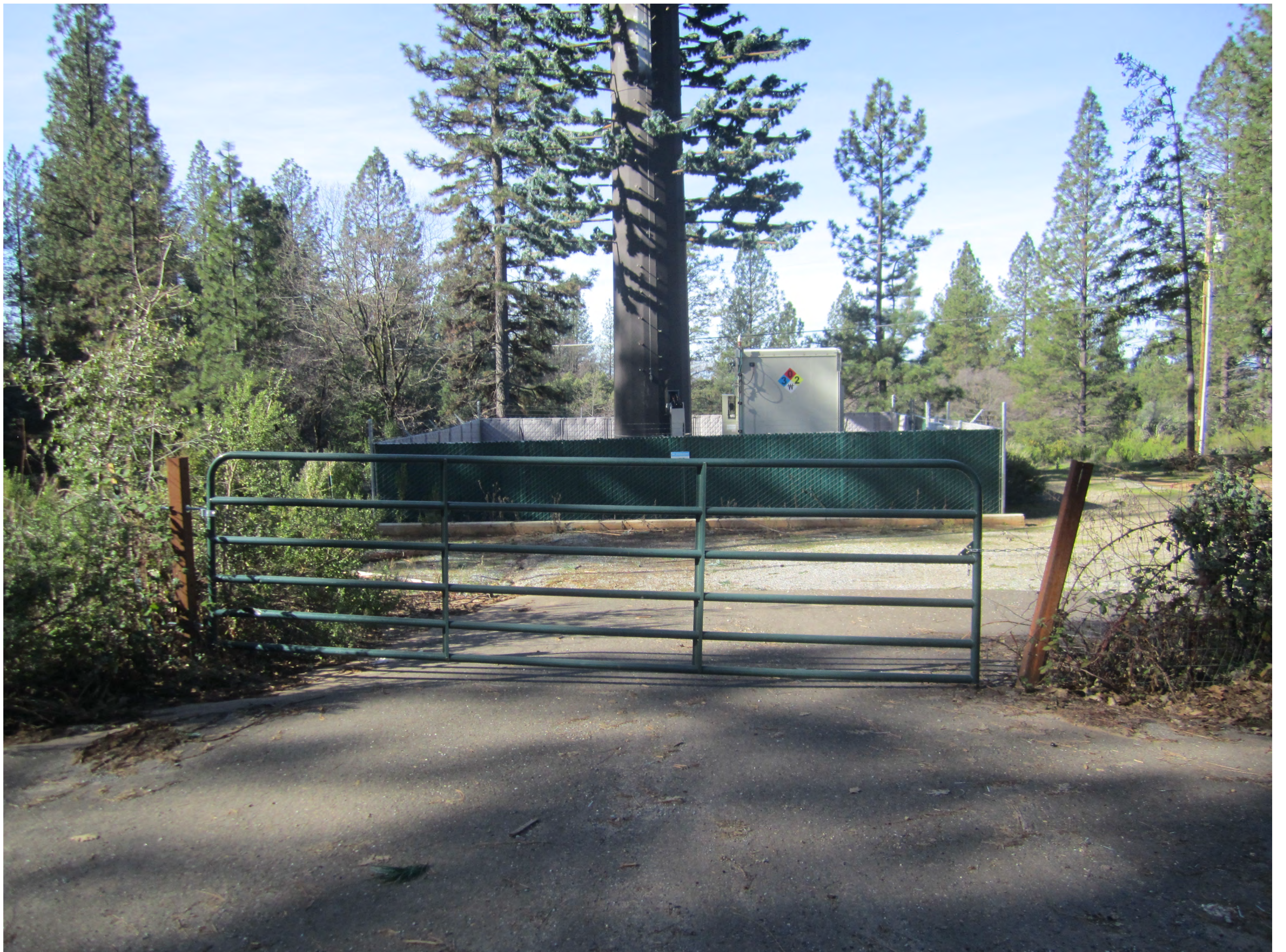
CUP-R24-0003/Five-Year Review of S17-0010 Exhibit E - Staff Current Site Photographs