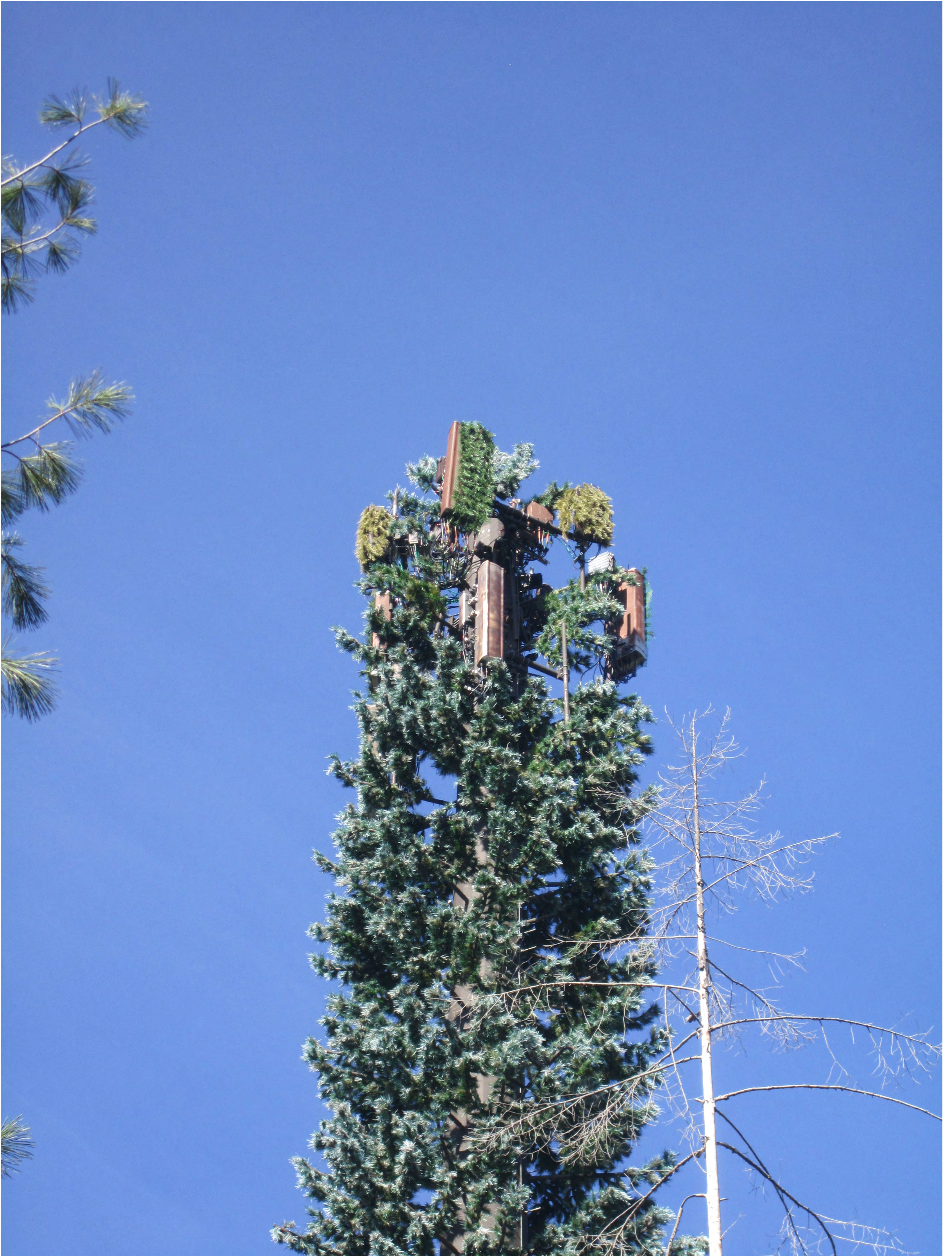
CUP-R24-0003/Five-Year Review of S17-0010 Exhibit E - Staff Current Site Photographs