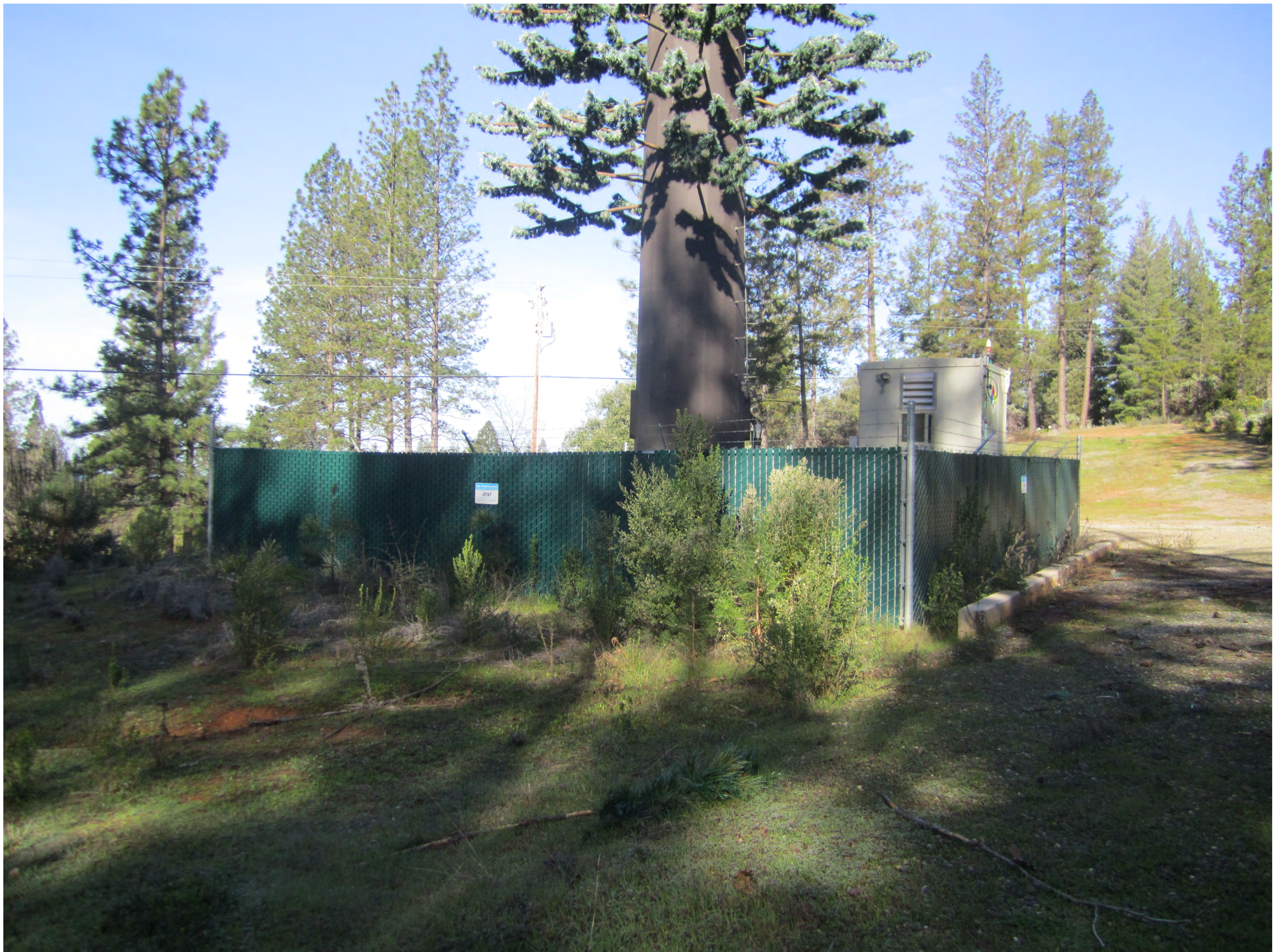
CUP-R24-0003/Five-Year Review of S17-0010 Exhibit E - Staff Current Site Photographs