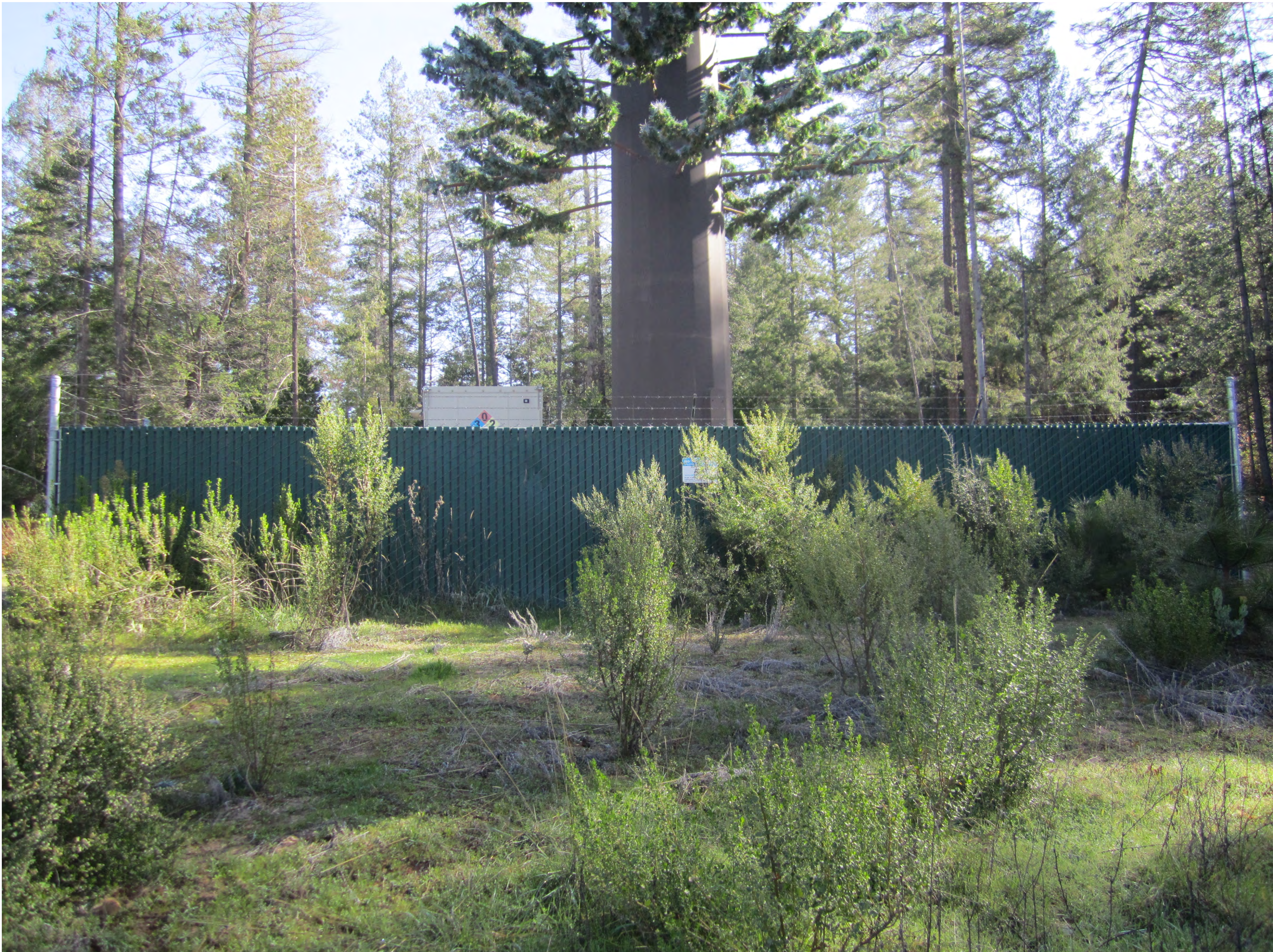
CUP-R24-0003/Five-Year Review of S17-0010 Exhibit E - Staff Current Site Photographs