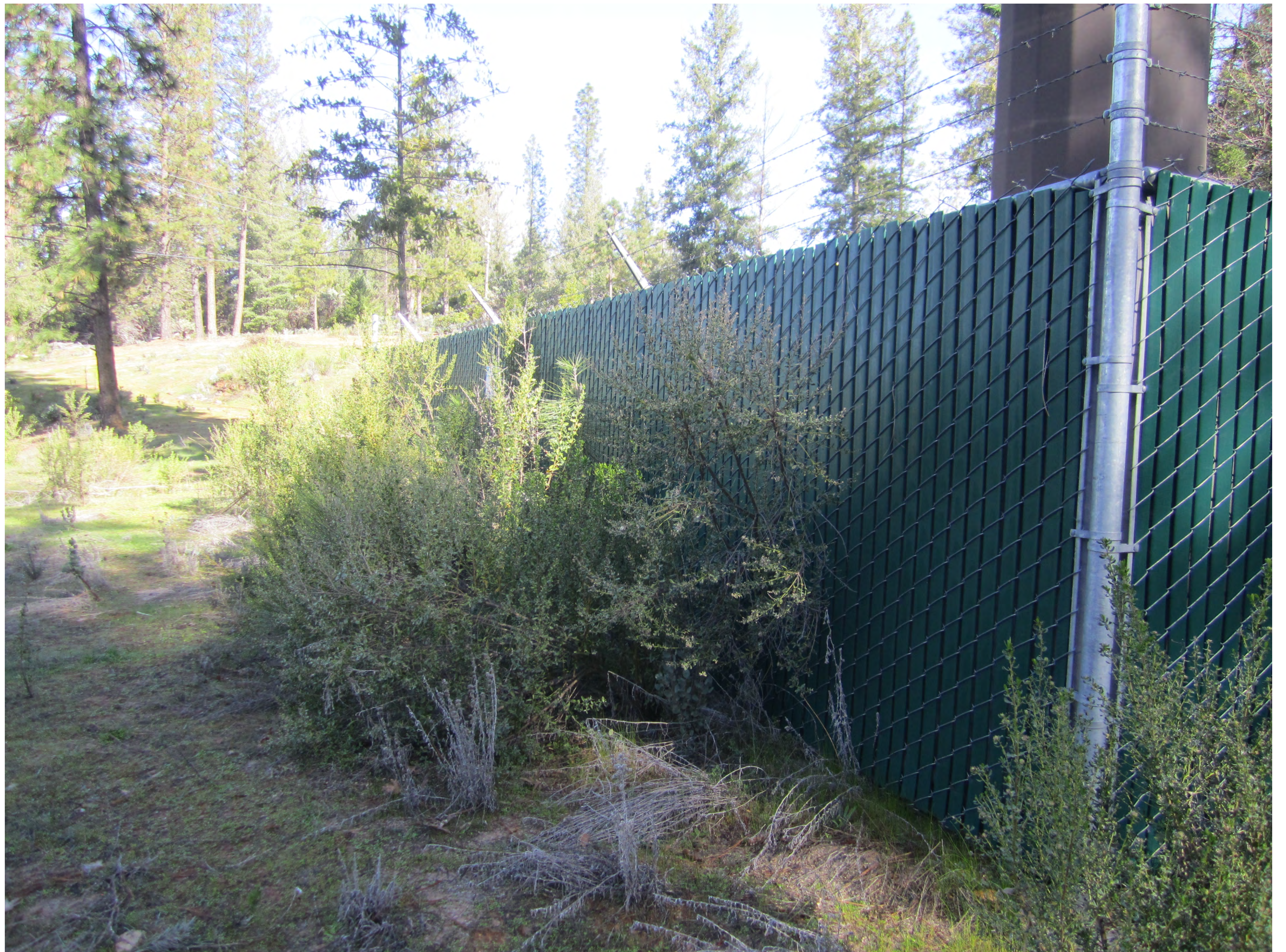
CUP-R24-0003/Five-Year Review of S17-0010 Exhibit E - Staff Current Site Photographs