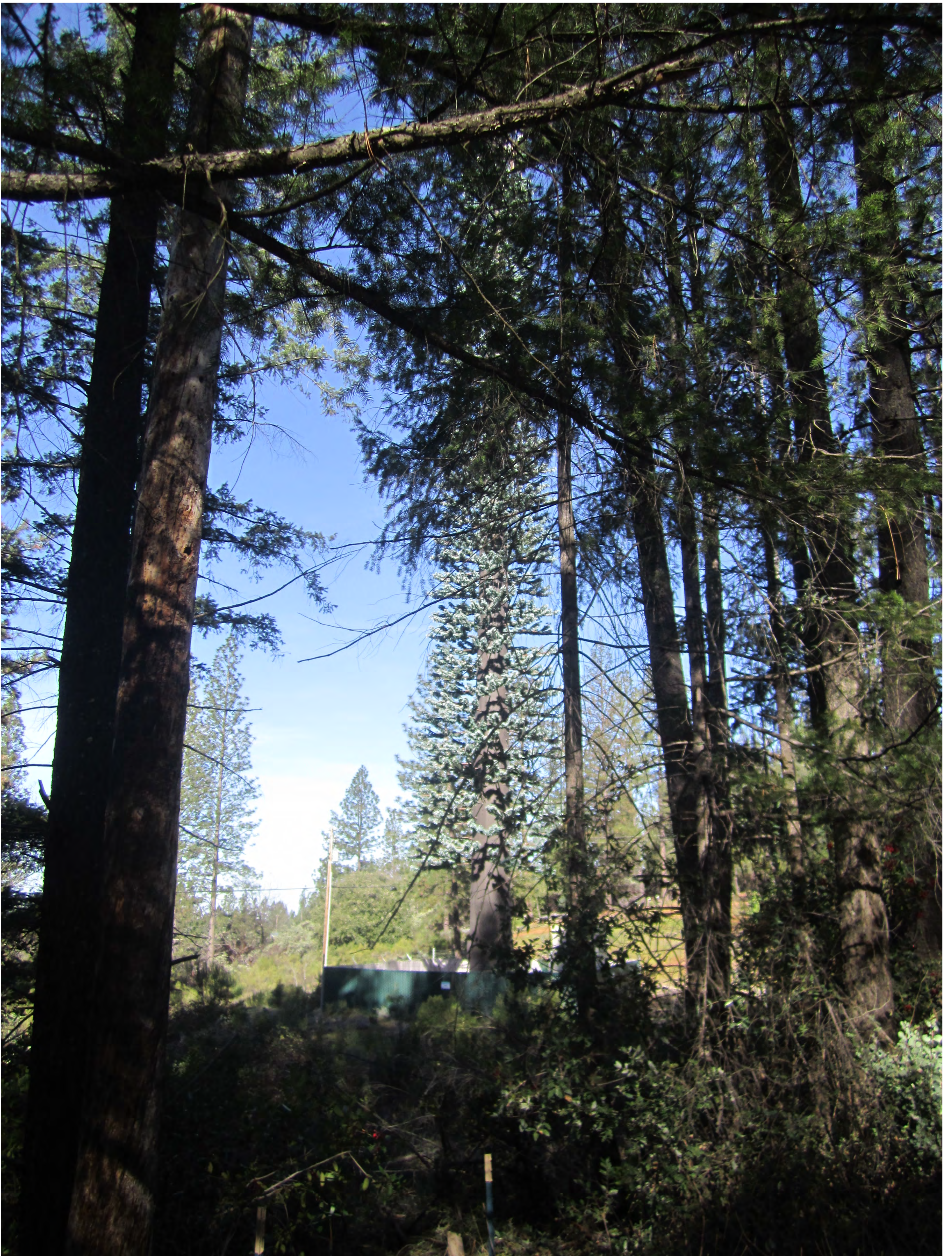
CUP-R24-0003/Five-Year Review of S17-0010 Exhibit E - Staff Current Site Photographs