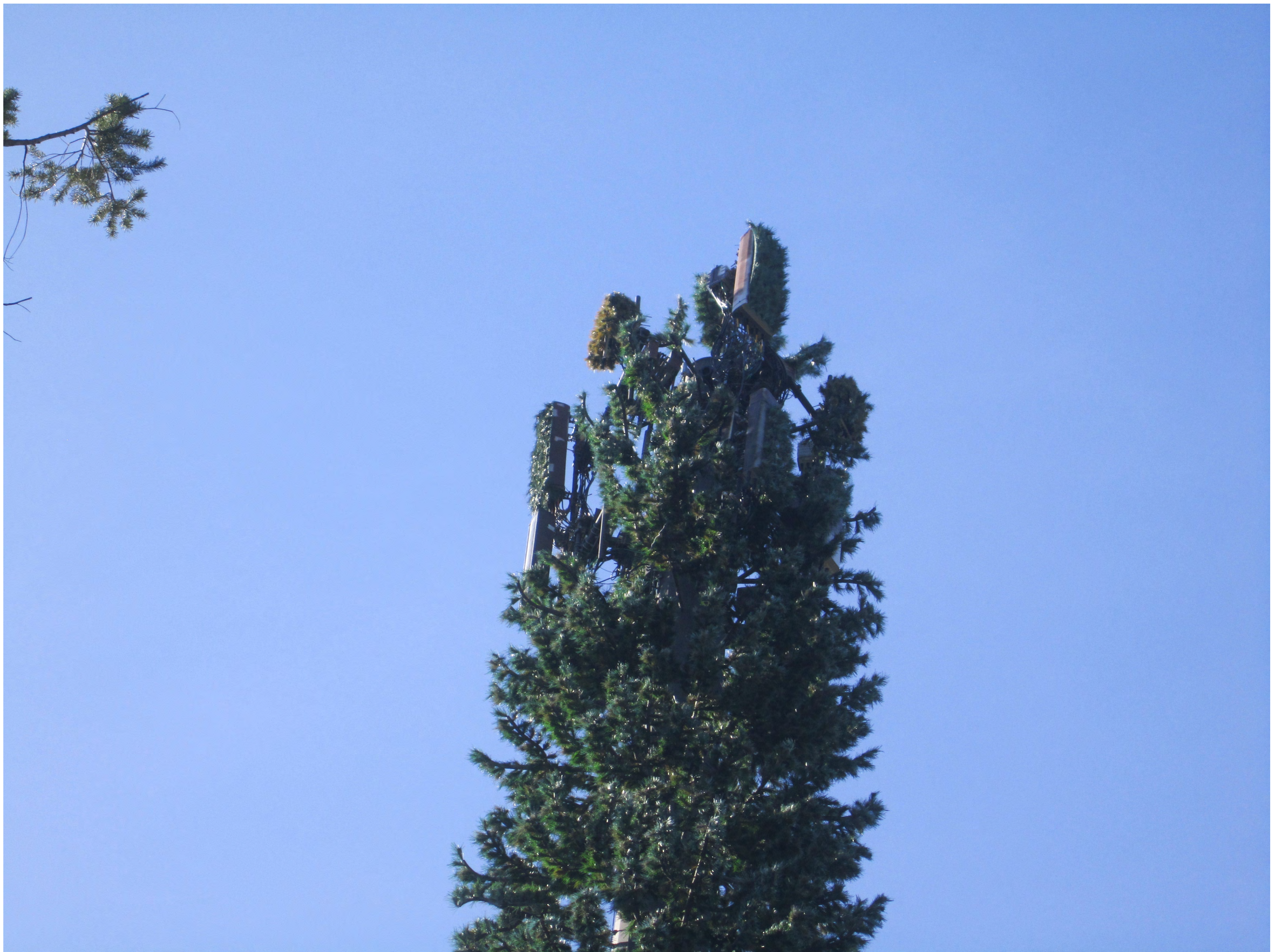
CUP-R24-0003/Five-Year Review of S17-0010 Exhibit E - Staff Current Site Photographs