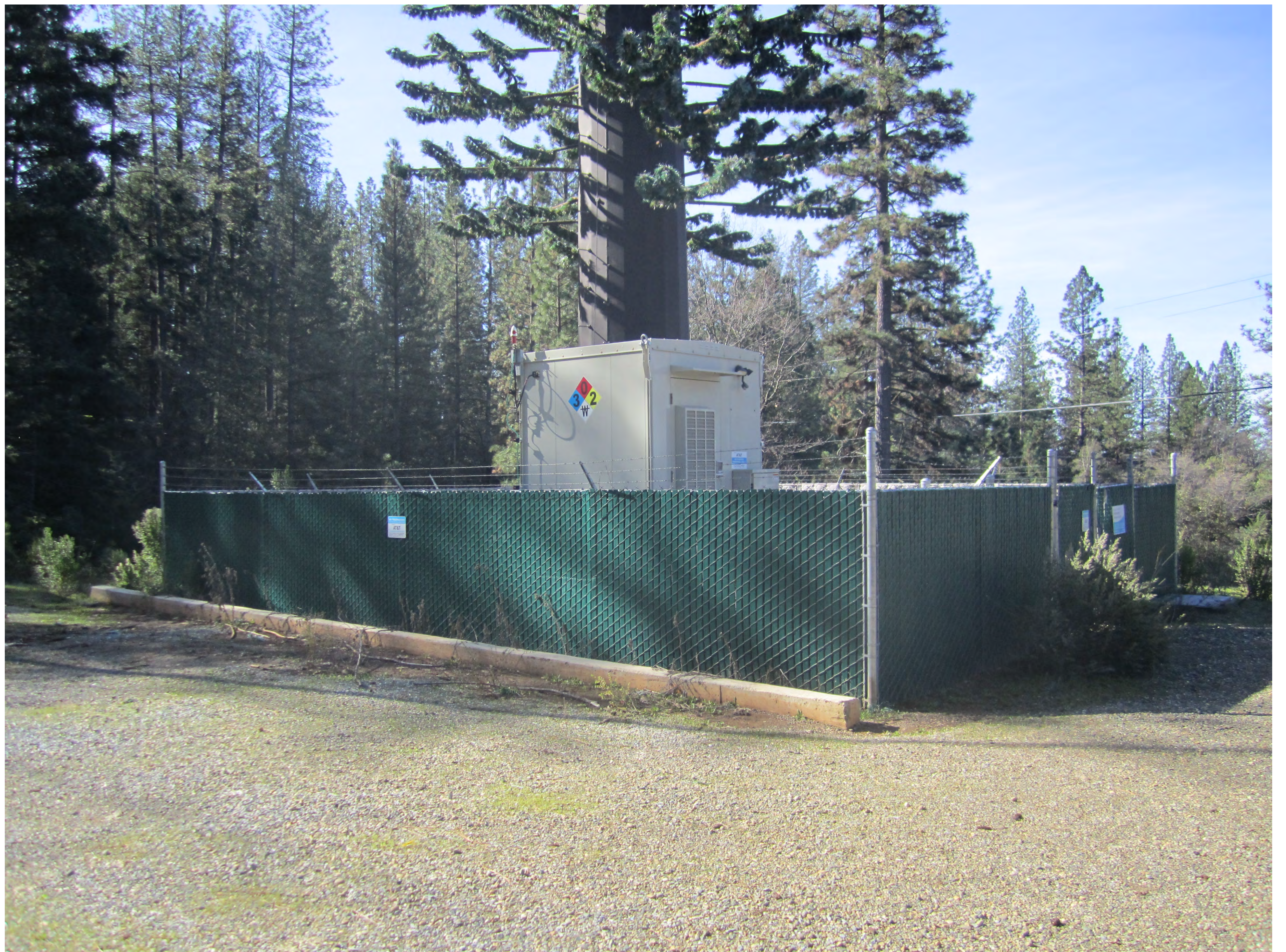
CUP-R24-0003/Five-Year Review of S17-0010 Exhibit E - Staff Current Site Photographs