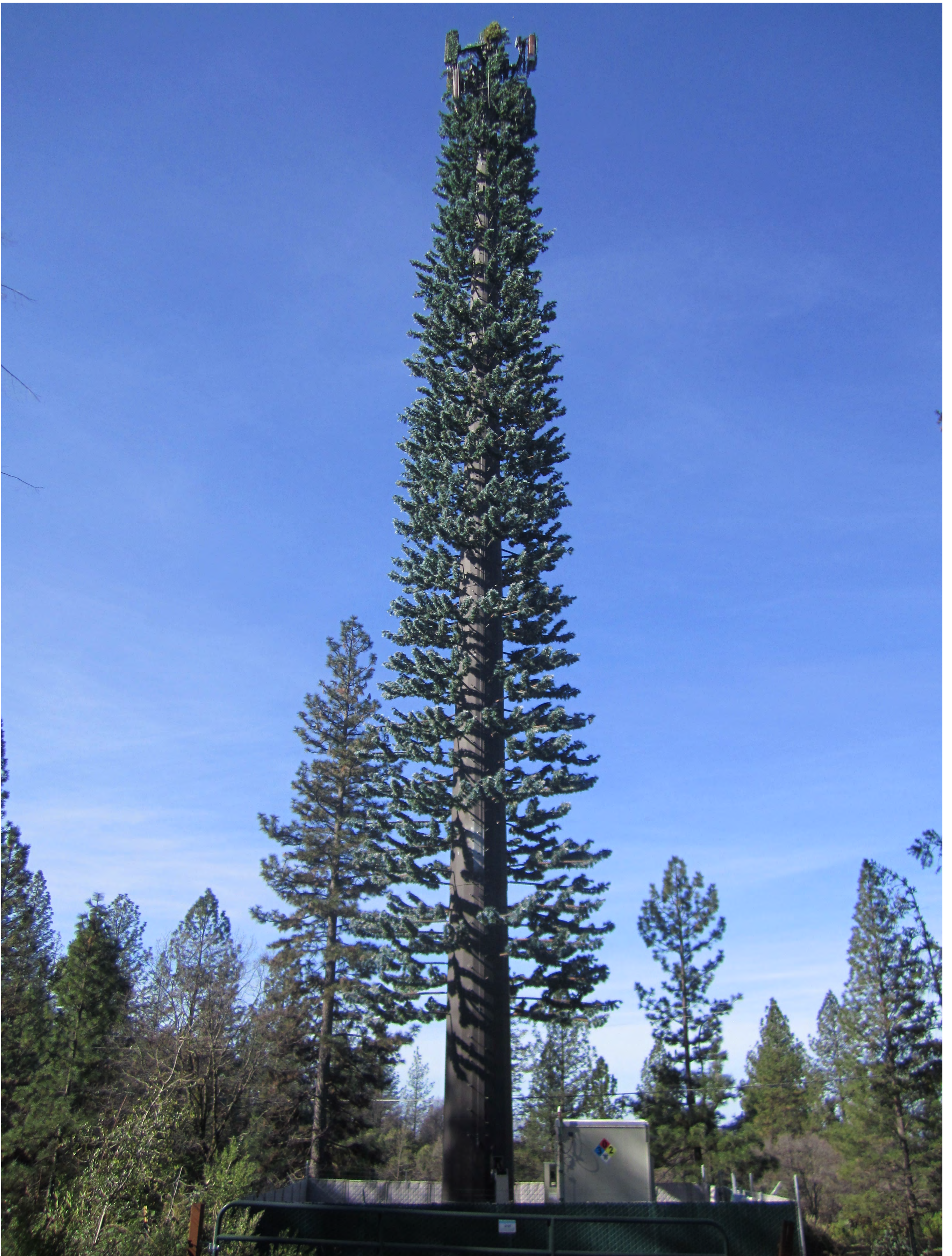
CUP-R24-0003/Five-Year Review of S17-0010 Exhibit E - Staff Current Site Photographs