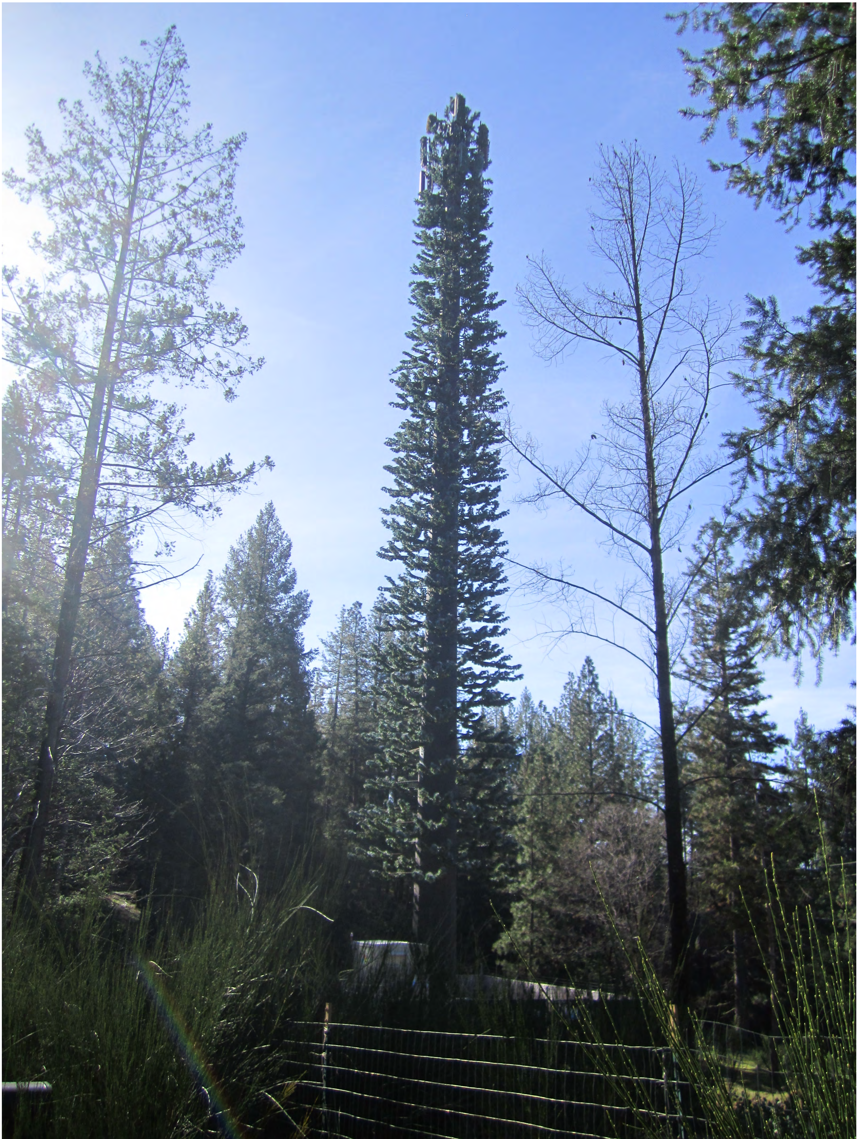
CUP-R24-0003/Five-Year Review of S17-0010 Exhibit E - Staff Current Site Photographs