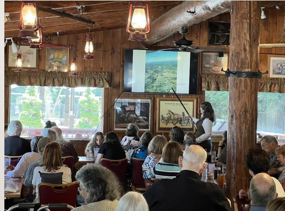
Field Talk on June 21 – The Bullion Bend Robbery