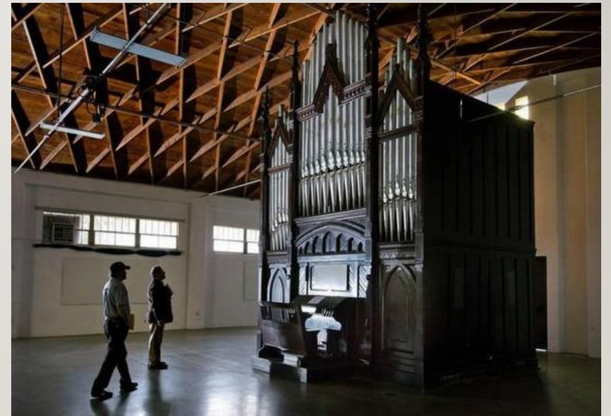
The Pipe Organ in the Organ Room at the Fairgrounds now