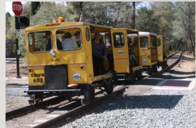
El Dorado Western Railroad, preserving our railroad history