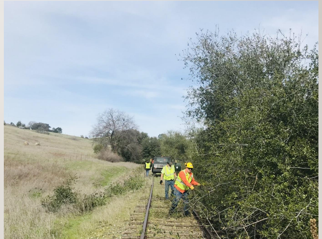
Clearing brush along the historic rails in the County