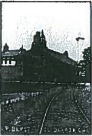
An early photograph of the El Dorado Depot with the school visible on the hill in the background. The El Dorado Community Hall is now located in the old school building. The plan would recreate the depot, loading platform and rail siding.

The El Dorado County Historical Railroad Park will be a county museum facility where historical railroad artifacts are displayed and operated for the enjoyment and education of the public. It will be located in the town of El Dorado utilizing the existing Sacramento-Placerville Transportation Corridor (SPTC) right of way, located north of Pleasant Valley Road on Oriental Street.