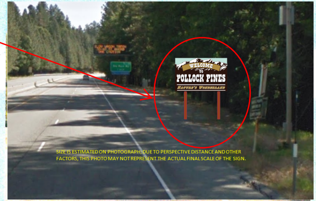
SIZE IS ESTIMATED ON PHOTOGRAPH DUE TO PERSPECTIVE DISTANCE AND OTHER FACTORS, THIS PHOTO MAY NOT REPRESENT THE ACTUAL FINAL SCALE OF THE SIGN.

TO BE MAINTAINED BY CEDAPP AT CEDAPP EXPENSE