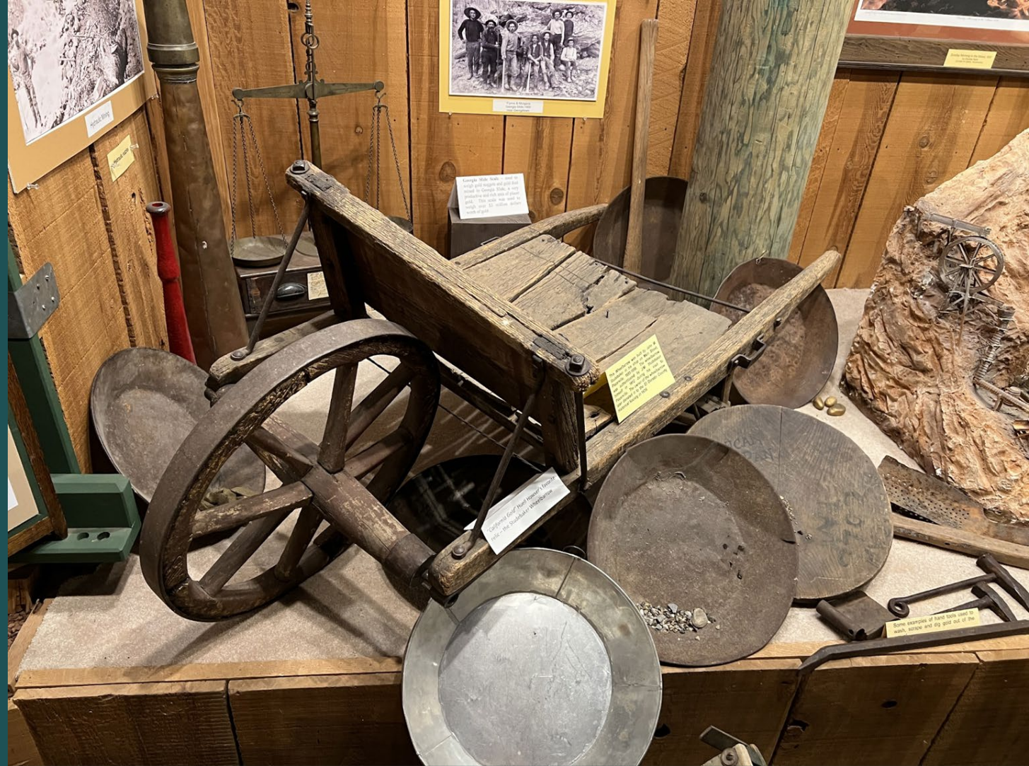
Wheelbarrow made by JM Studebaker on display at the EDCHM. By 1855, "Wheelbarrow Johnny"'s wheelbarrows were fetching $10 each, enabling him to amass savings amounting to $3,000.