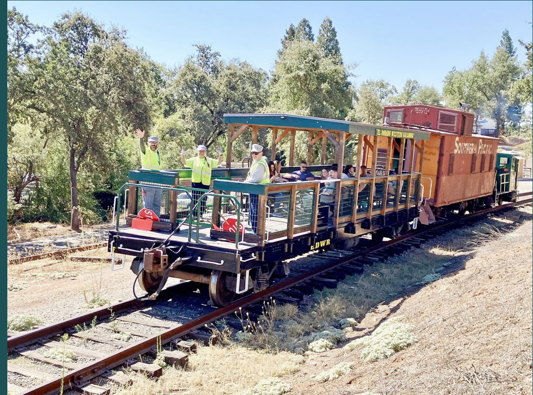
El Dorado Western Railroad (EDWRR), preserving our railroad history.