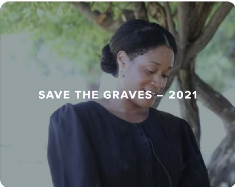
SAVE THE GRAVES – 2021