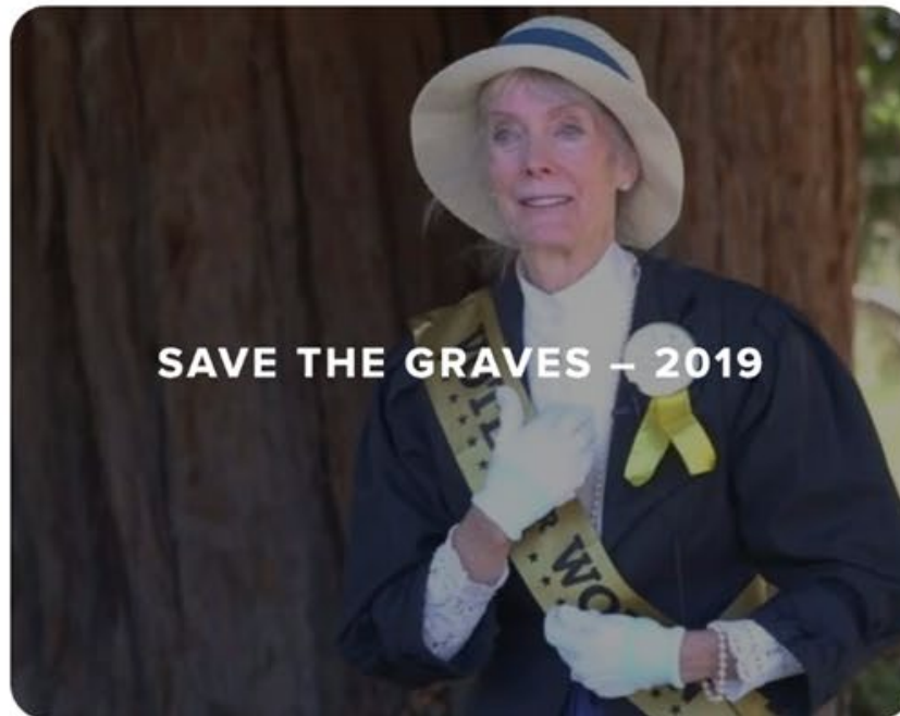
SAVE THE GRAVES – 2019

Research performed at EDCHM has supported and enabled 5 years of Save-the-Graves performances, attended by over 3000 community members!