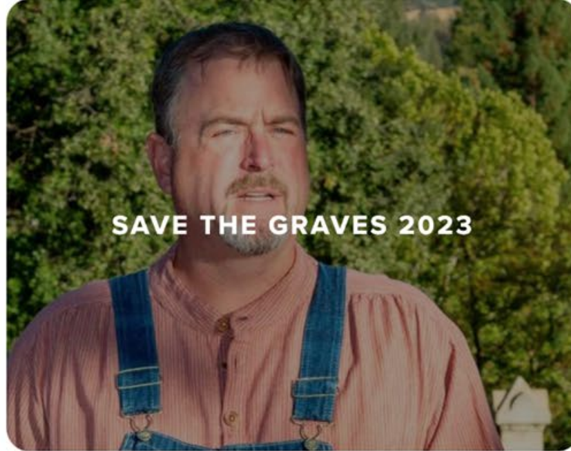
SAVE THE GRAVES 2023