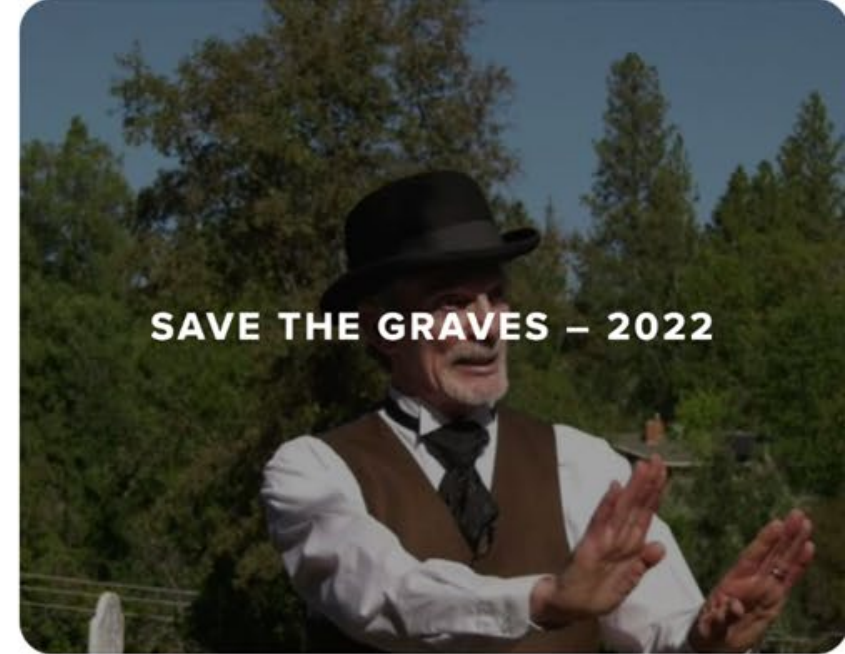
SAVE THE GRAVES – 2022