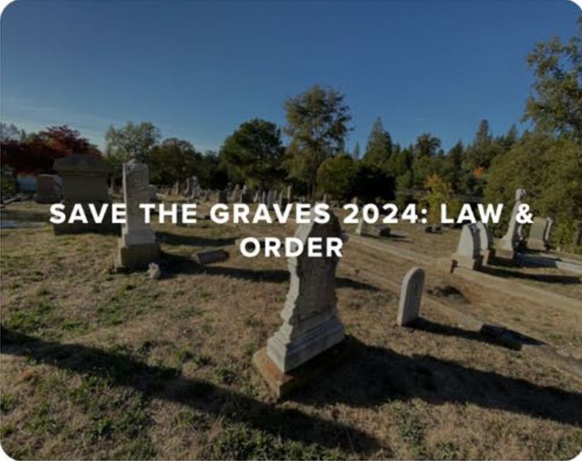
SAVE THE GRAVES 2024: LAW & ORDER