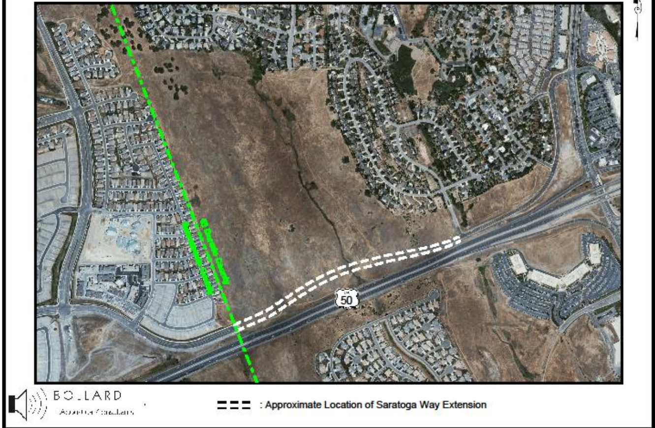
Figure 1 Saratoga Way Extension Project Vicinity