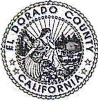
Exhibit B Board of Supervisors Policy D-1