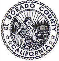
Exhibit B Board of Supervisors Policy D-1