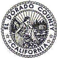
Exhibit B Board of Supervisors Policy D-1