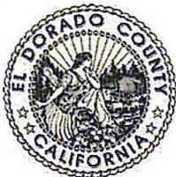
Exhibit B Board of Supervisors Policy D-1