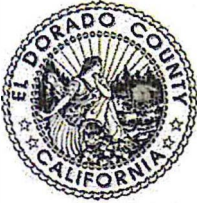
Exhibit B Board of Supervisors Policy D-1