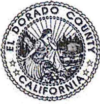
Exhibit B Board of Supervisors Policy D-1 COUNTY OF EL DORADO, CALIFORNIA BOARD OF SUPERVISORS POLICY