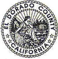
Exhibit B Board of Supervisors Policy D-1