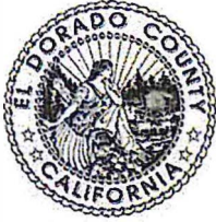
Exhibit B Board of Supervisors Policy D-1