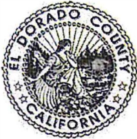
Exhibit B Board of Supervisors Policy D-1 COUNTY OF EL DORADO, CALIFORNIA BOARD OF SUPERVISORS POLICY