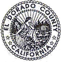
Exhibit B Board of Supervisors Policy D-1