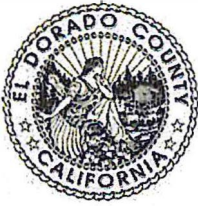
Exhibit B Board of Supervisors Policy D-1