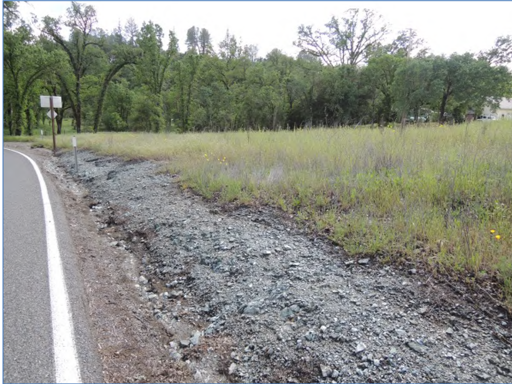
This potential staging area northwest of the existing bridge is a serpentine outcrop.

Below is a photo of this northwest staging area—it is one of two “potential” staging areas mentioned in the IS/MND, but the only staging area identified in Figure 2 . (A second potential staging area to the southeast of the bridge is mentioned, but not included in Figure 2). 5