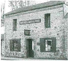
Fountain Tallman Museum