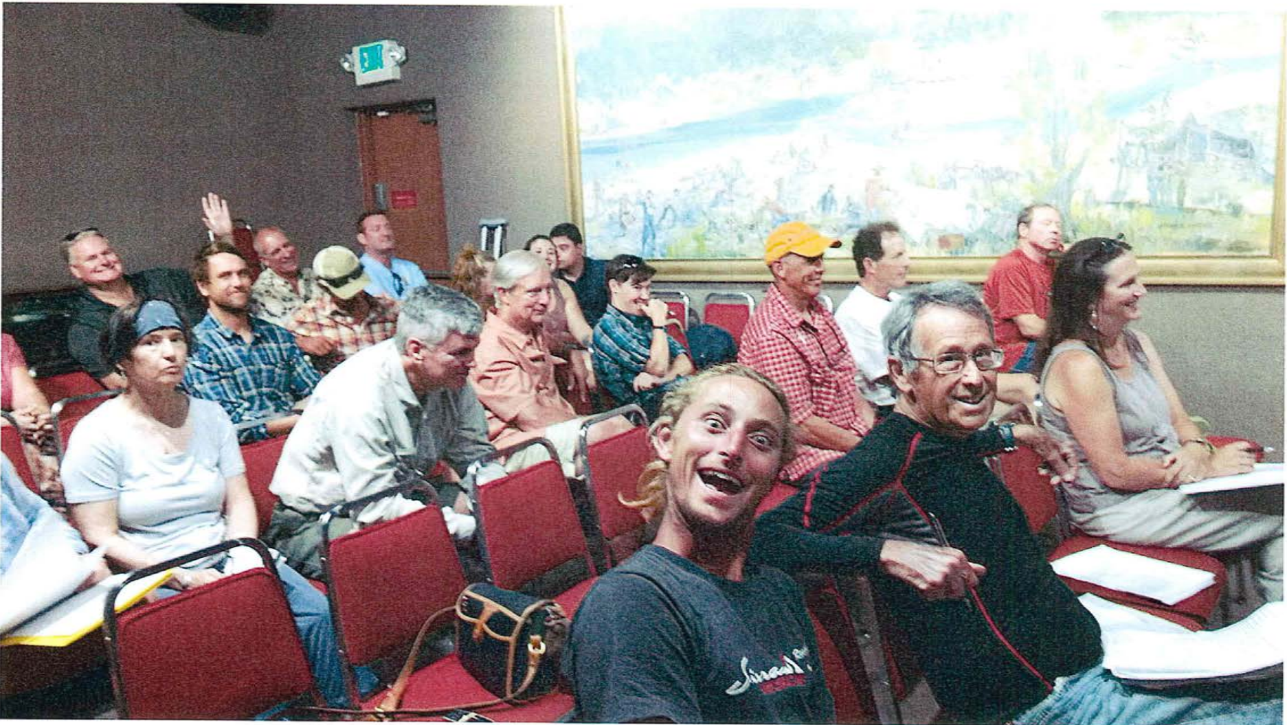
17-0659 Public Comment PC Rcvd 08-08-17