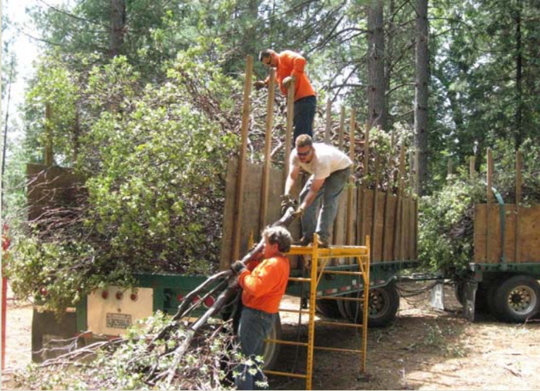
Fuels Treatment: Thinning