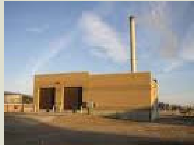
Clean, woody biomass energy plant