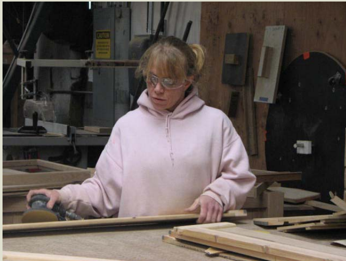
Solid Wood Product: Molding & Flooring