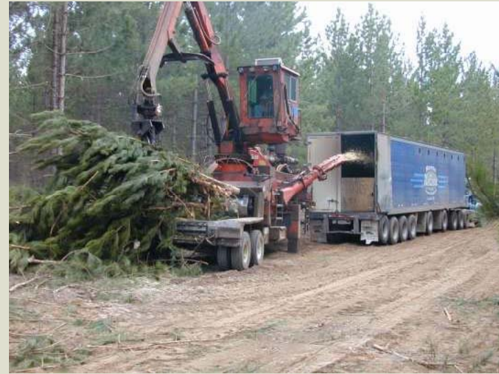
Biomass material transport to facility