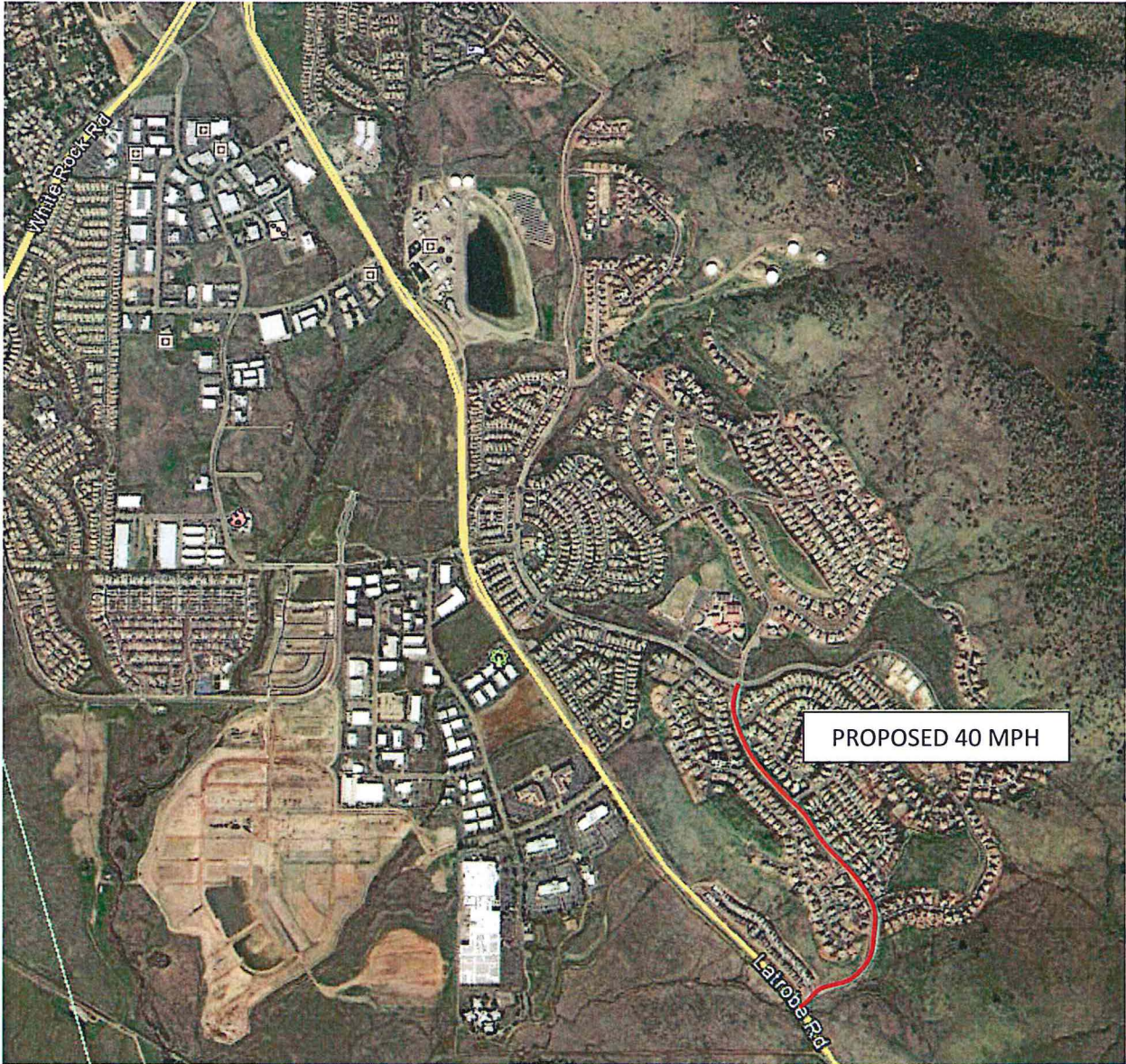
October 2018 Speed Survey