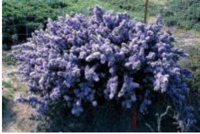
All Star Garden