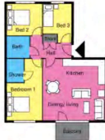
Typical layout: 3 bedroom layout with basic storage