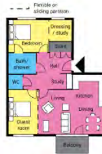
Layout B: Flexible 1/2 bedroom layout with additional storage + study space