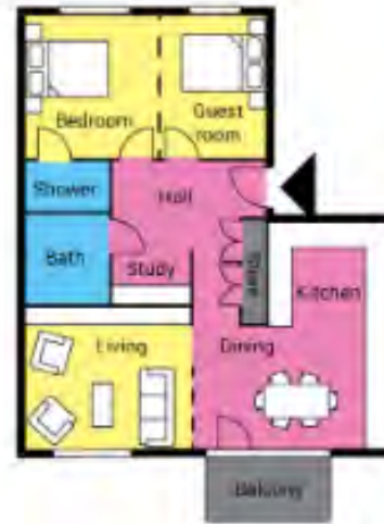
Layout A: Flexible 2/3 bedroom layout with additional storage + study space