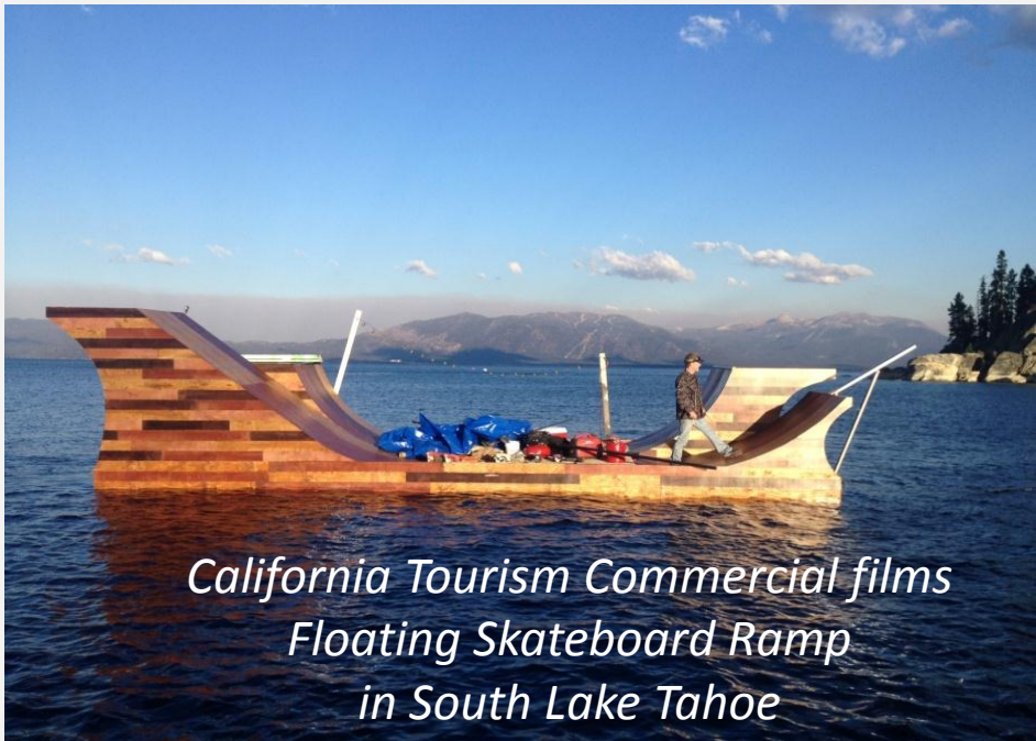
California Tourism Commercial films Floating Skateboard Ramp in South Lake Tahoe