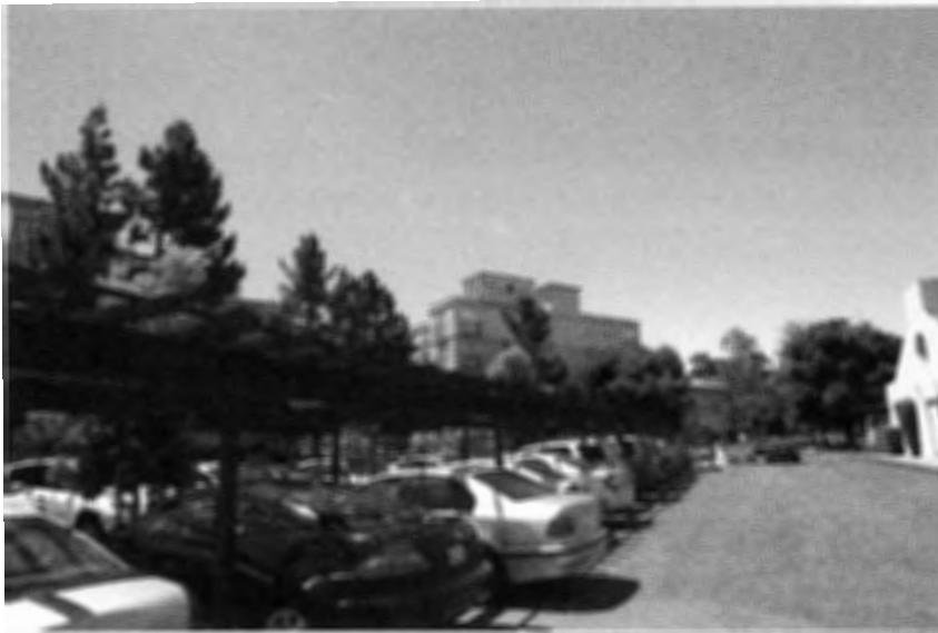
675 El Camino, Palo Alto