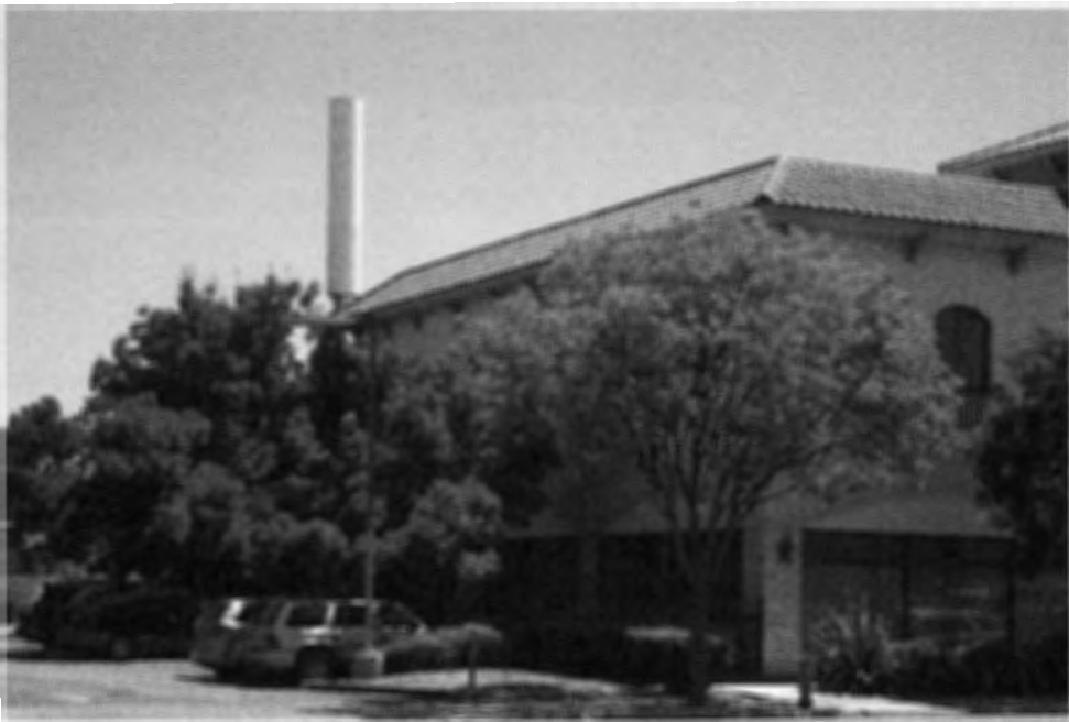
2110 Story Road, San Jose