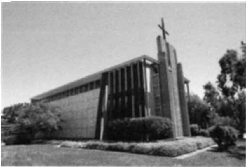
1985 Louis Road, Palo Alto