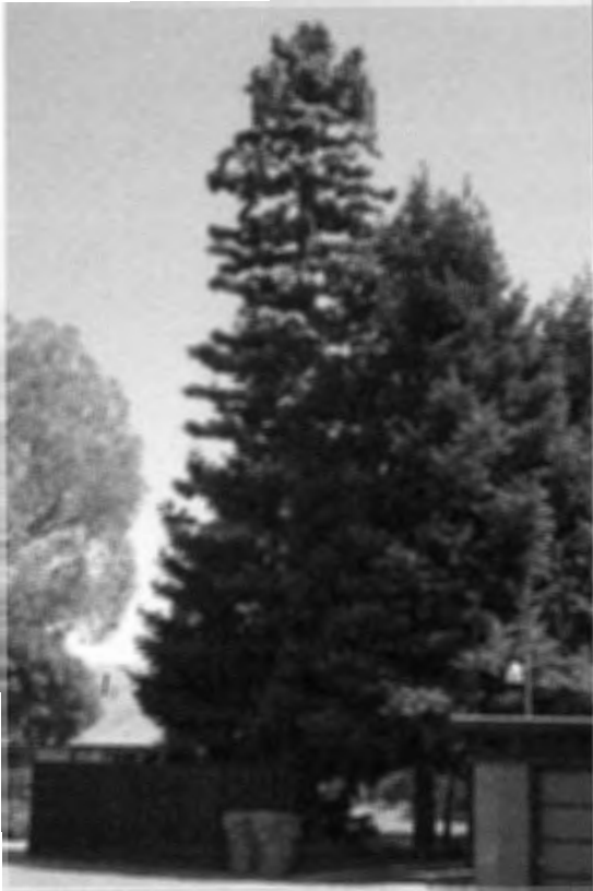
12770 Saratoga Ave, Saratoga