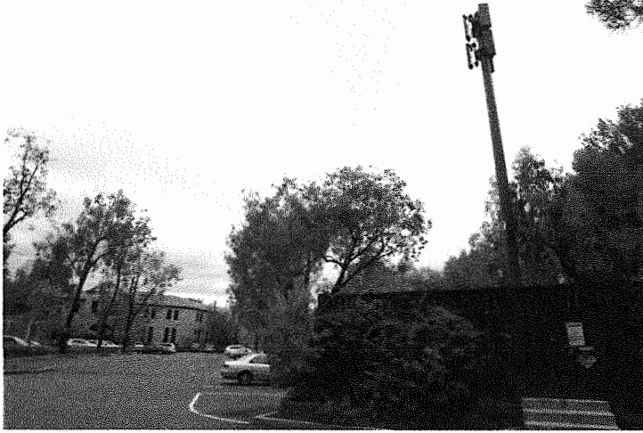
4009 Miranda, Palo Alto