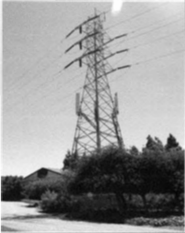
1082 Colorado St. Palo Alto