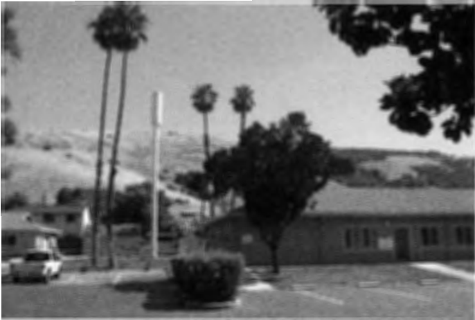
366 St. Julie Drive, San Jose