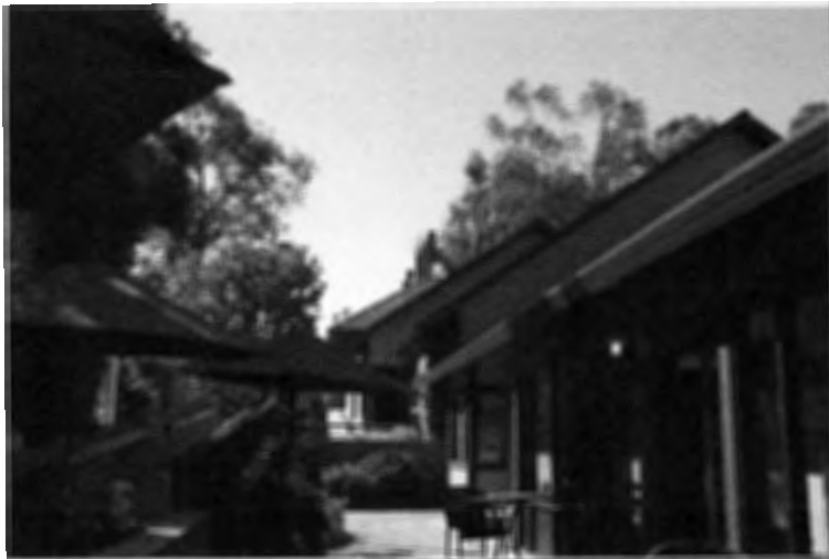
14407 Big Basin Way