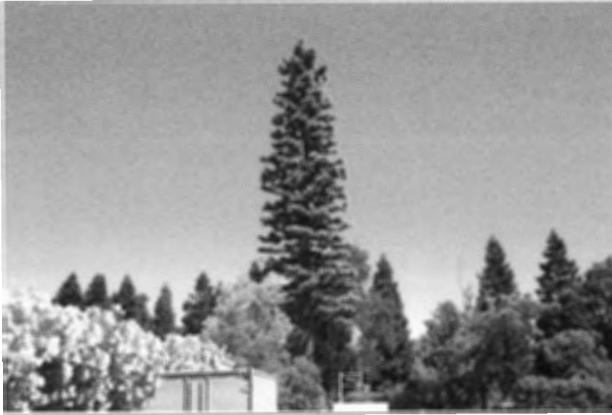
2575 Hanover, Palo Alto