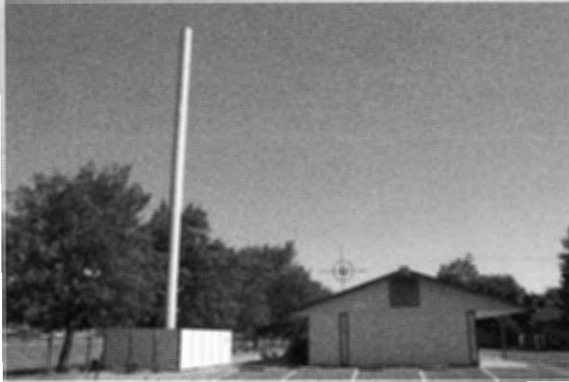
3675 Payne, San Jose