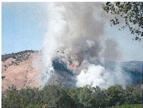
Mt. Murphy 070107 Fire.jpg 276K