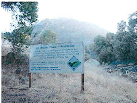
ARC MGD Nat Resources post 7-2007 fire.jpg 483K