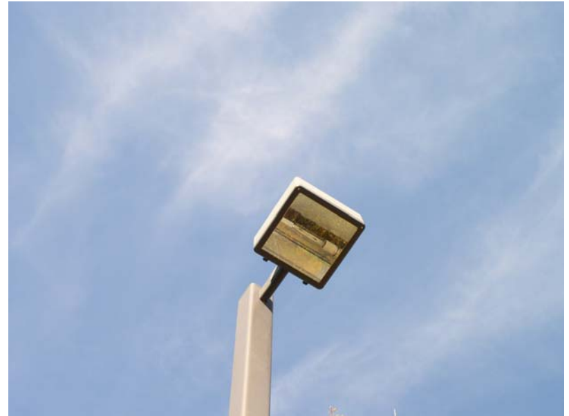
Existing single square fixture at Bldg C and on Fairlane Ct