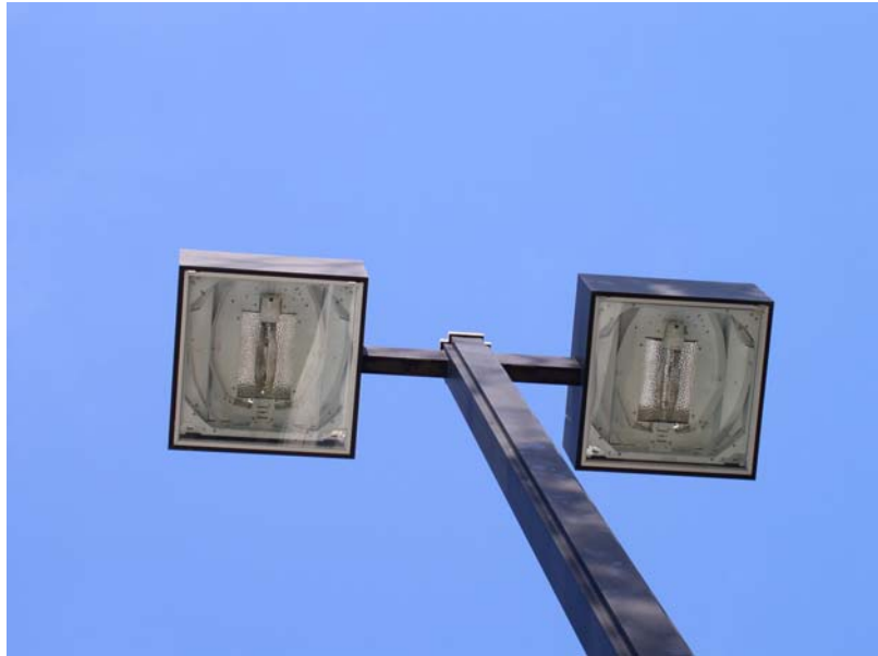
Existing double square fixture at Bldg C parking lot