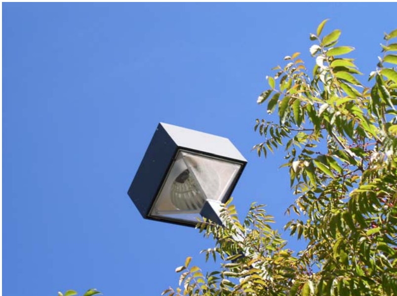
Existing single "funnel" fixture at Bldg A