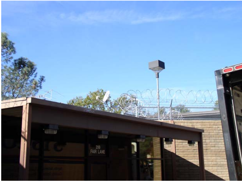
Existing single "funnel" fixture at Juvenile Hall