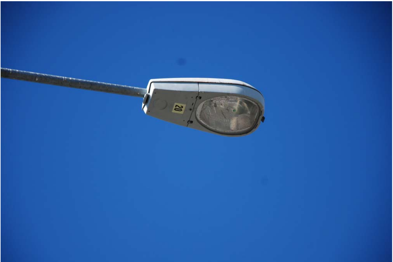
Existing 200 Watt High Pressure Sodium Safety Street Light Fixture