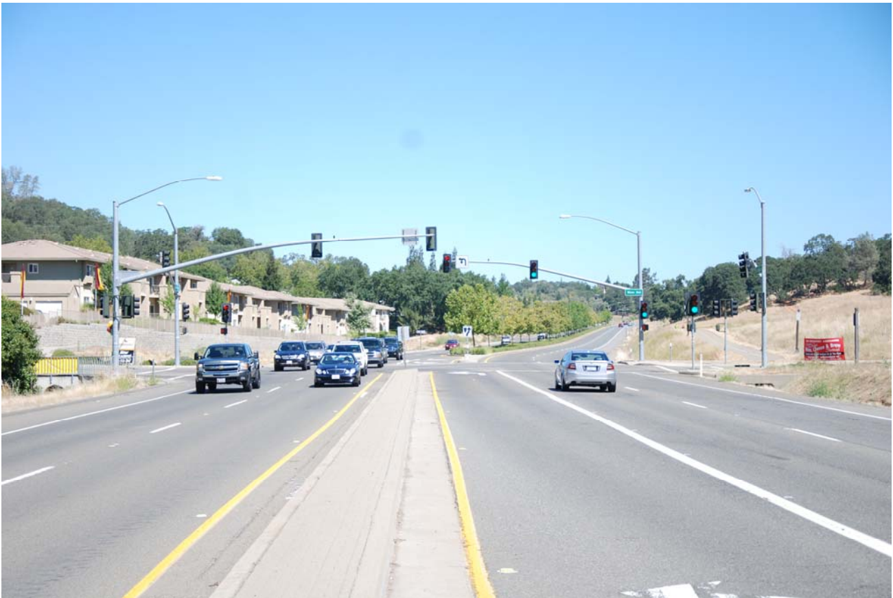
Existing Safety Street Lights on Traffic Signals (intersection on El Dorado Hills Blvd)