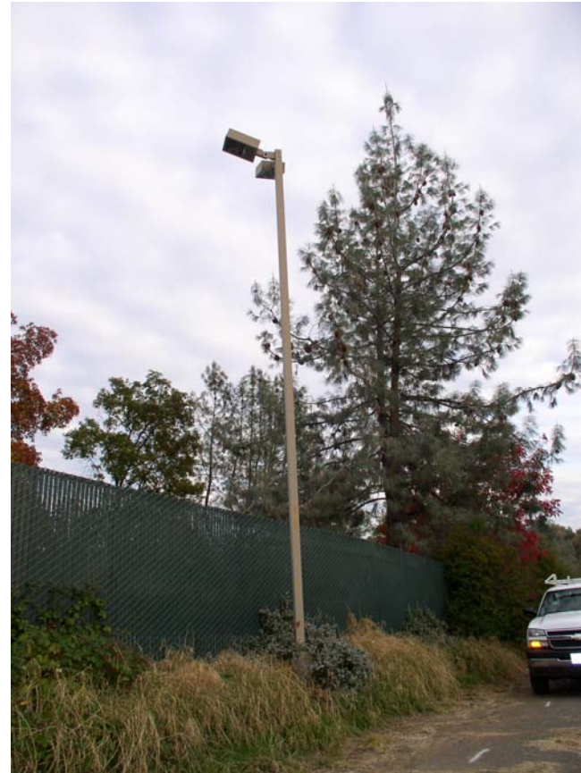
Existing double fixture behind Juvenile Hall