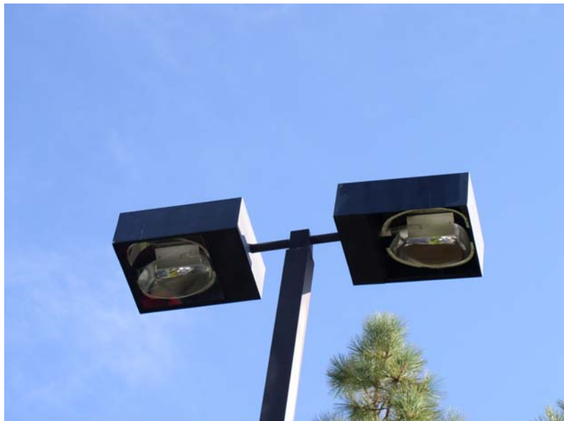
Existing double rectangle fixture at Library and Bldgs A & B