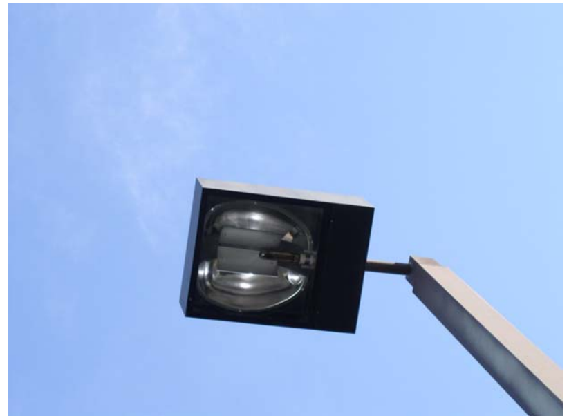
Existing single rectangle fixture at Library and Bldgs A & B