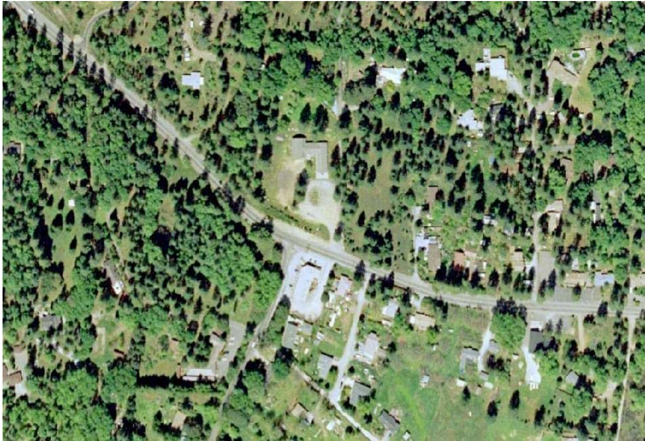
FIGURE 2 AERIAL PHOTOGRAPH