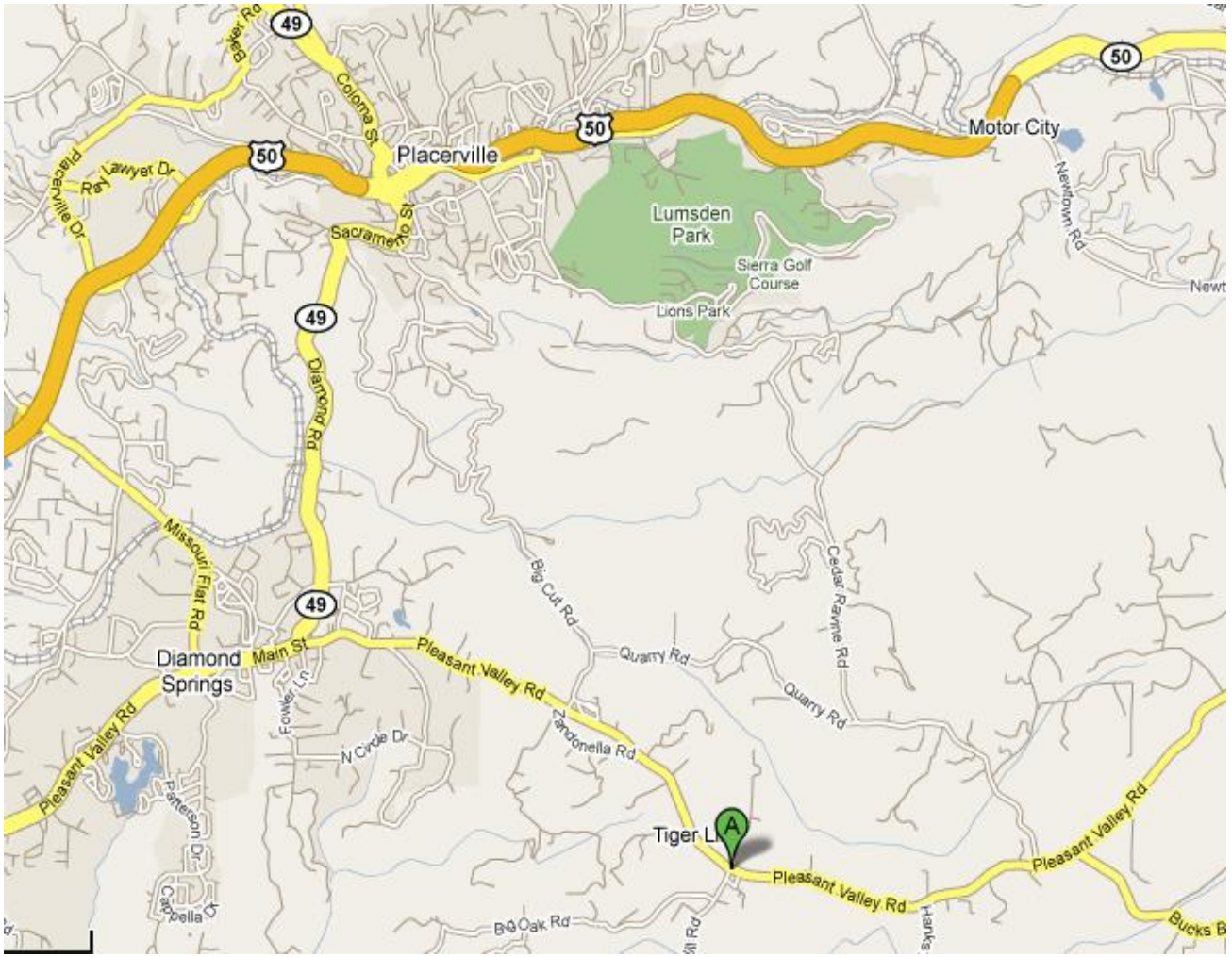
FIGURE 1 VICINITY MAP