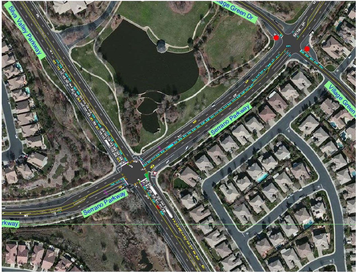
Figure 2: Existing Plus Interchange (Current Configuration) AM Peak Hour Traffic Operations