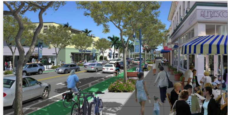
Lower VMT Per Capita