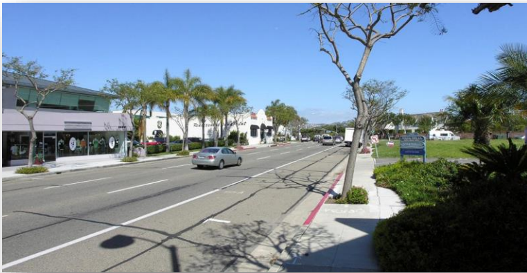
Higher VMT Per Capita