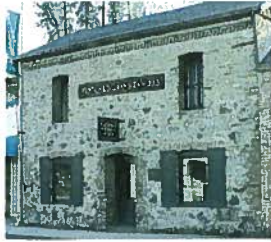
Fountain Tallman Museum

RECEIVED BOARD OF SUPERVISORS EL DORADO COUNTY