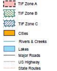
EXHIBIT B Three TIF Zone Map County of El Dorado

DISCLAIMER: THIS SECTION WAS COMPILED FROM PUBLIC RECORDS AND PUBLIC RECORDS ARE NOT GUARANTEED FOR ACCURACY OR COMPLETENESS. THE COUNTY OF EL DORADO IS NOT RESPONSIBLE FOR ANY ERRORS OR OMISSIONS. USERS MUST USE THIS INFORMATION AT THEIR OWN RISK. NOTES: LIMIT INFORMATION MAY COVER ADDITIONAL AREAS OUTSIDE OF THE DISPLAYED AREA. PREPARED AT THE REQUEST OF: DOT DATA Team DATE: 11/16/2022 MAP PREPARED BY: JAW/MLM DATE: 11/16/2022