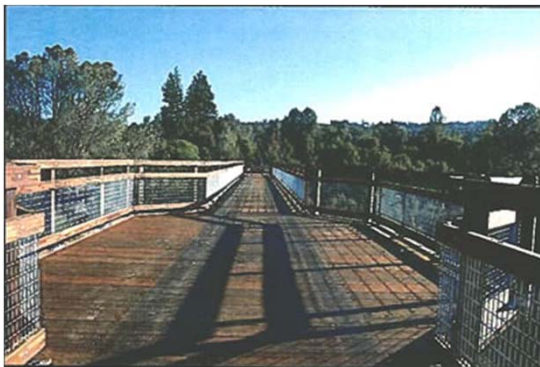
Missouri Flat Trail